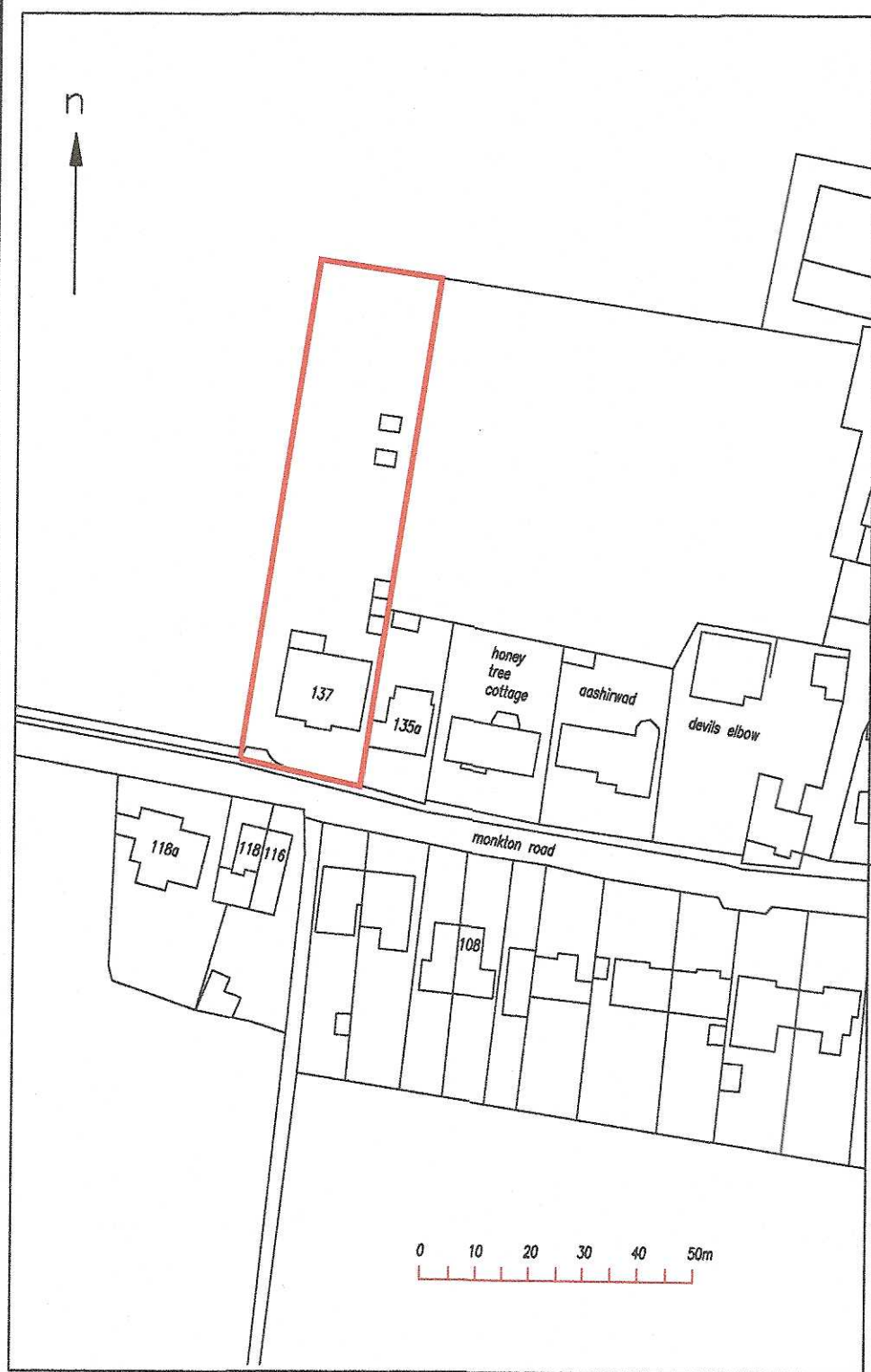
location plan - 1:1250