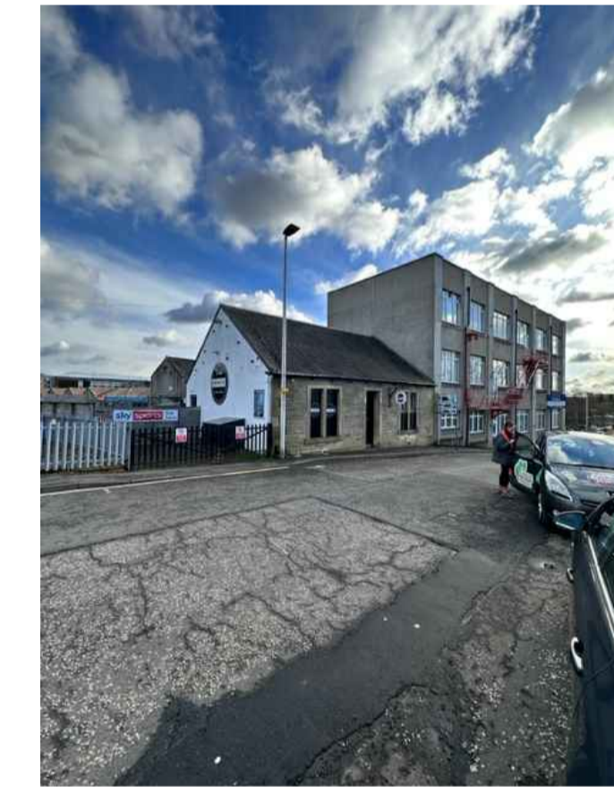
View along Gardners Lane