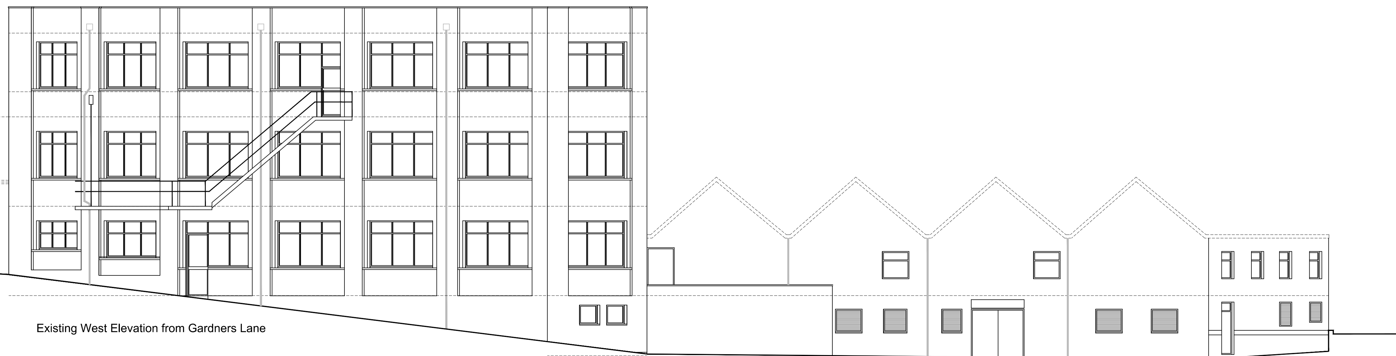
Existing West Elevation from Gardners Lane