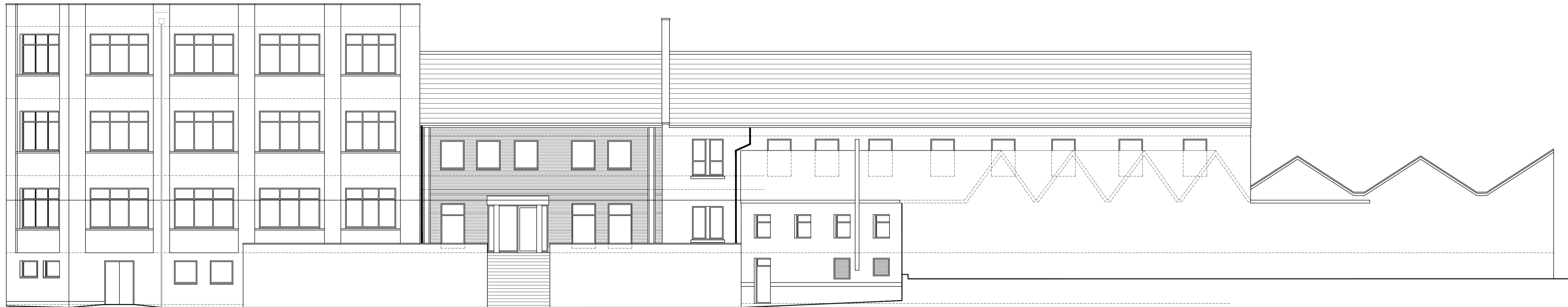
Existing South & East Elevation