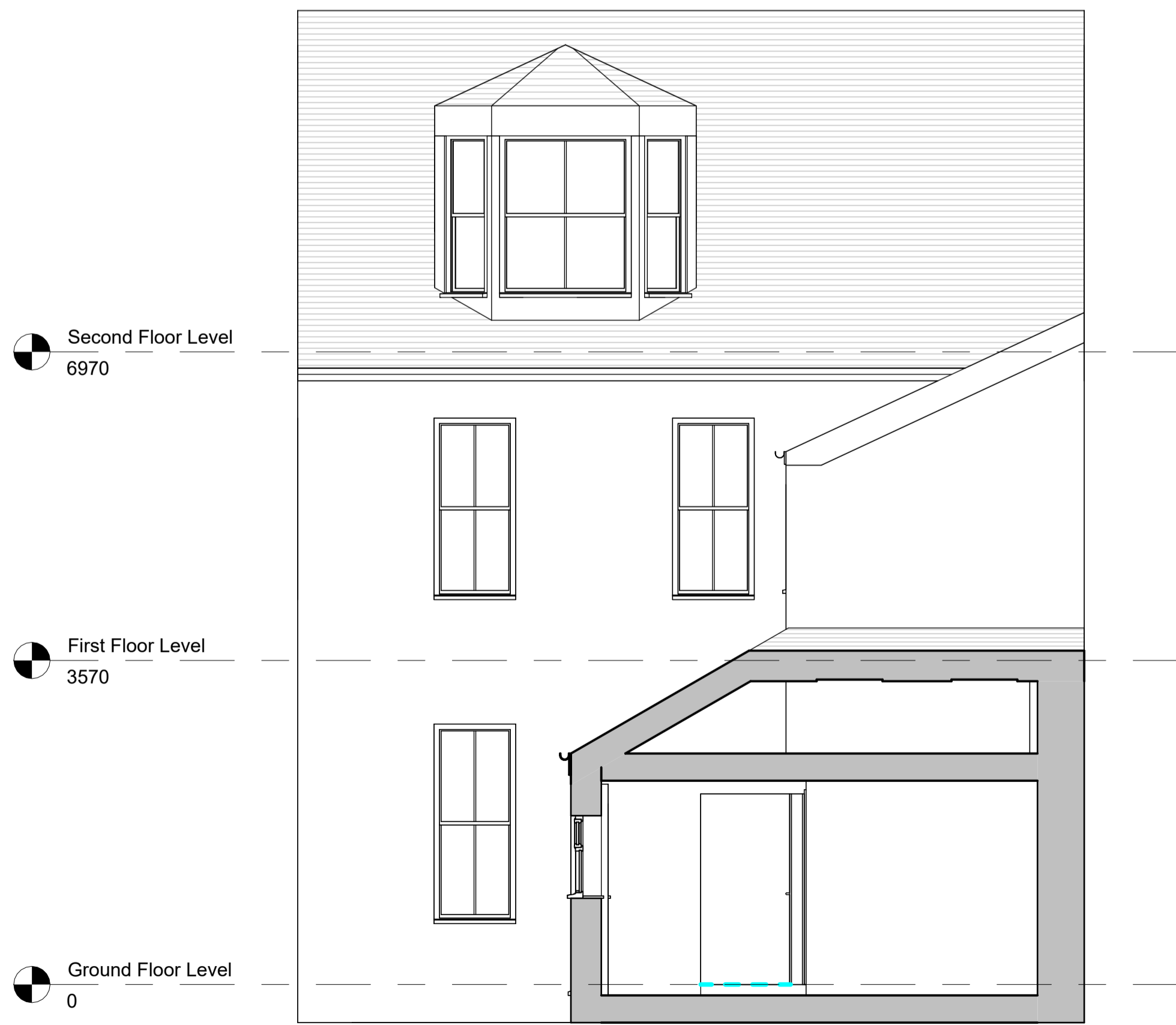
4 Section 2 1 : 50