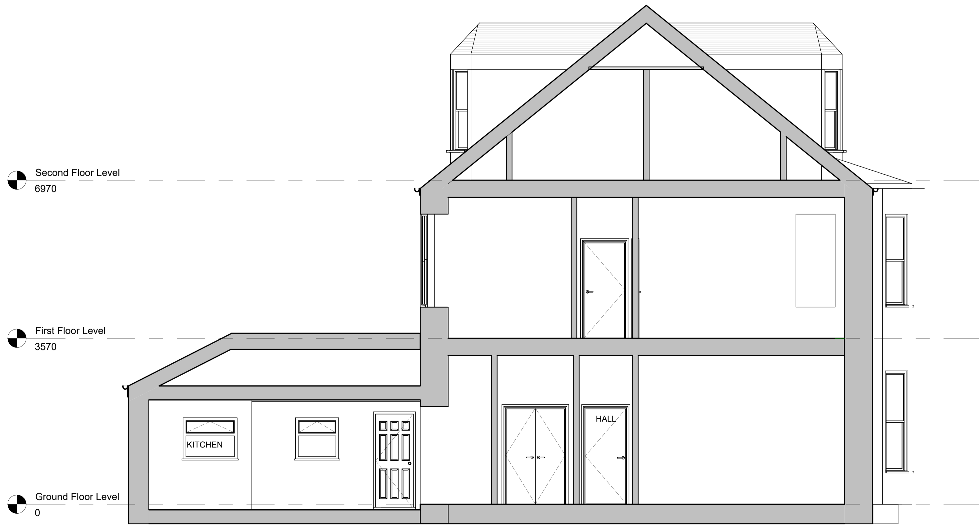
3 Section 1 1 : 50