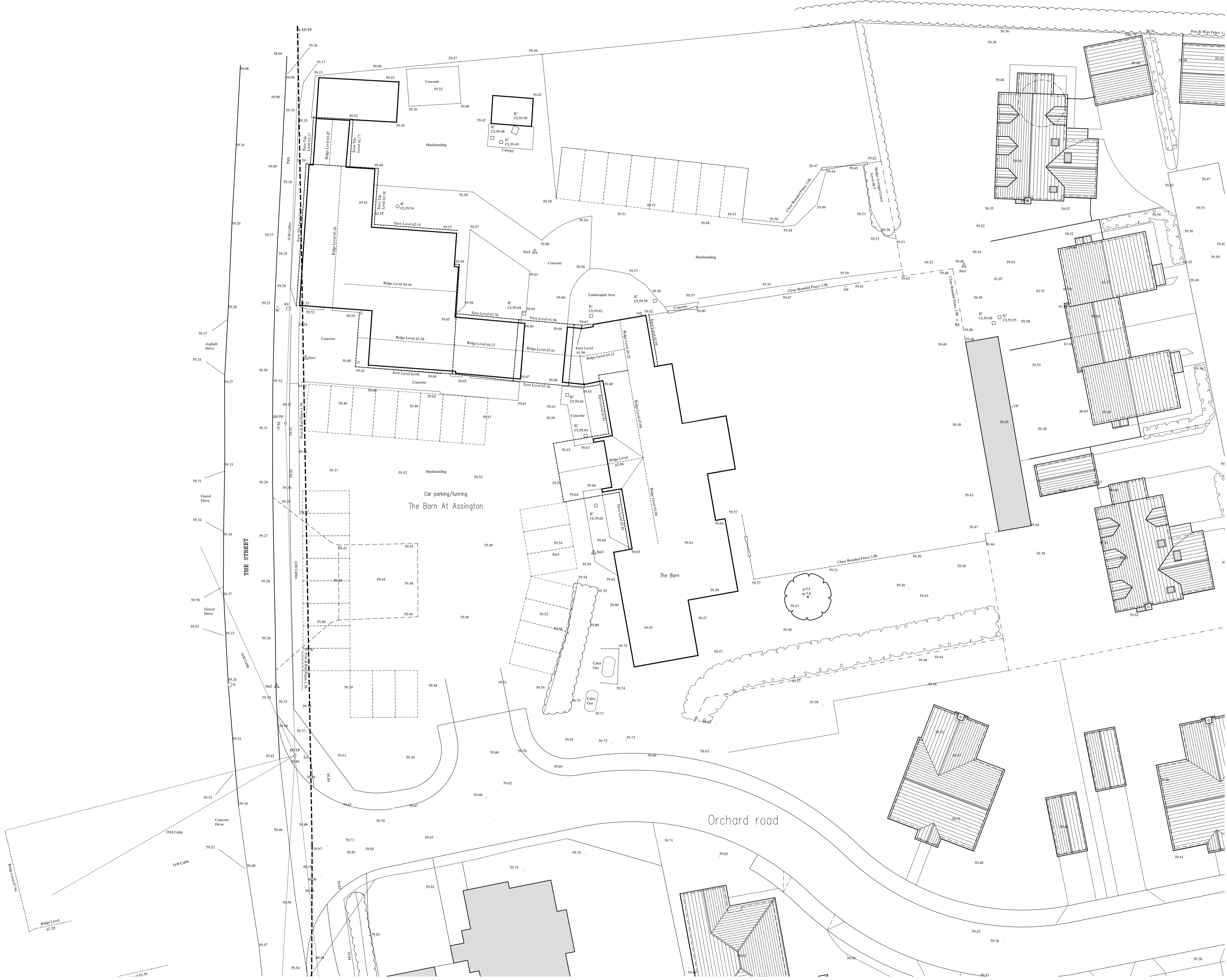
Existing Site Plan - Scale: 1:200