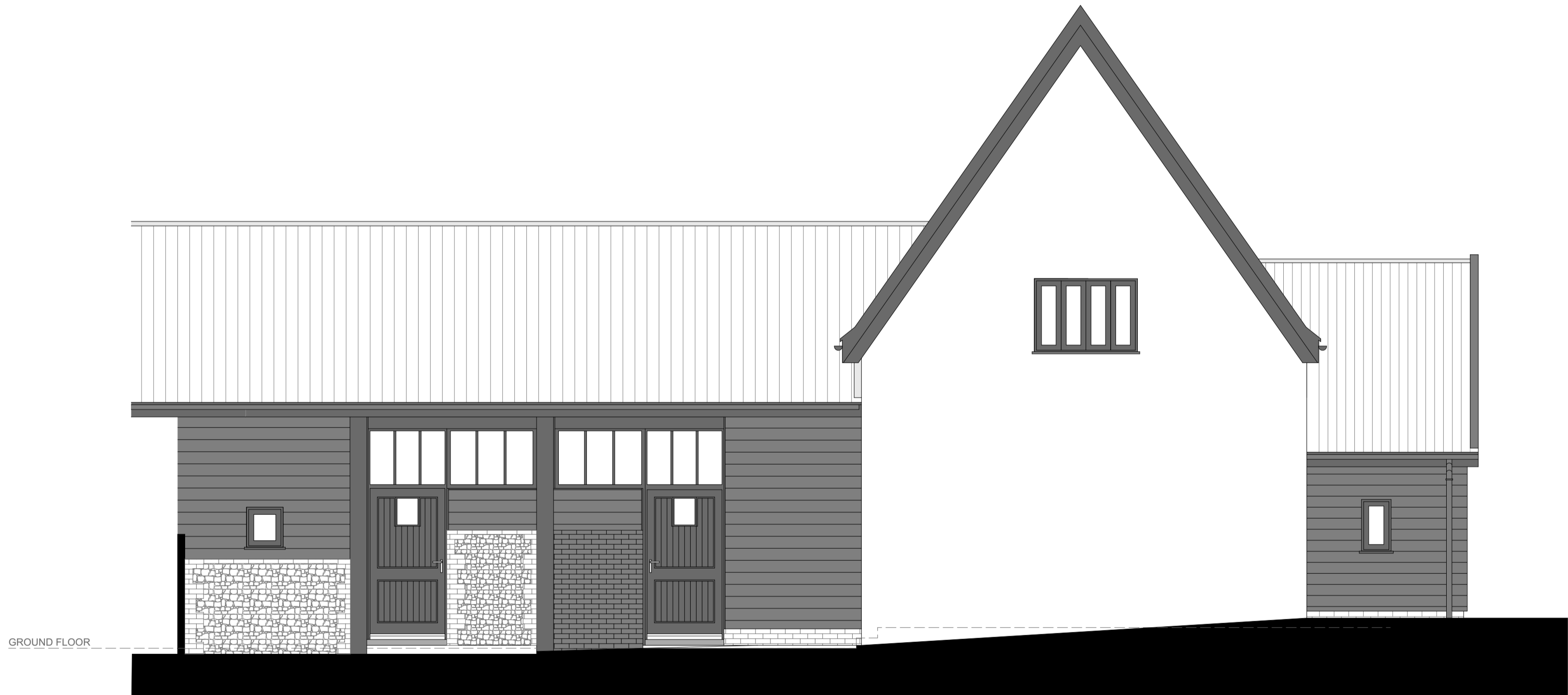
EXISTING SOUTH WEST ELEVATION