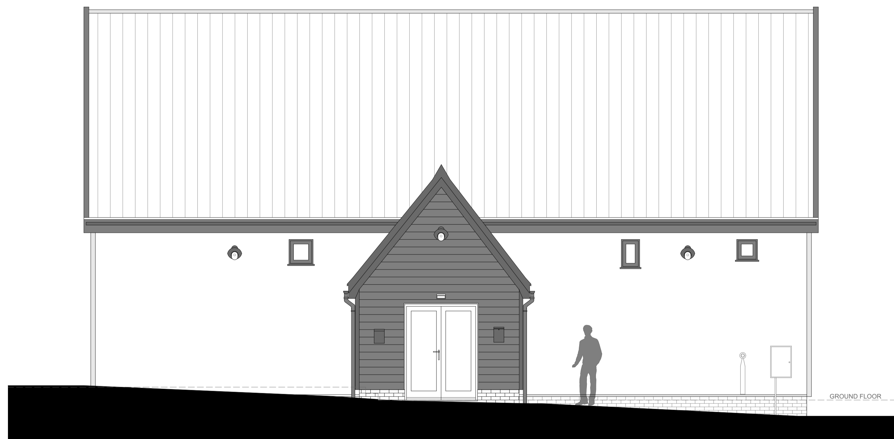
EXISTING SOUTH EAST ELEVATION