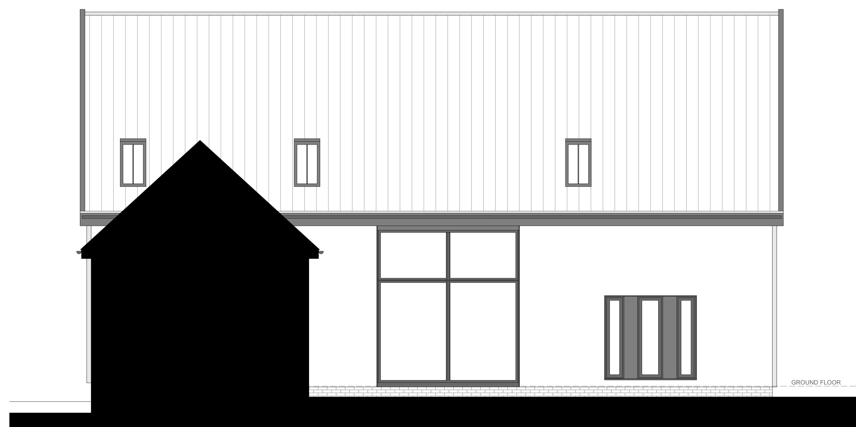
EXISTING NORTH WEST ELEVATION