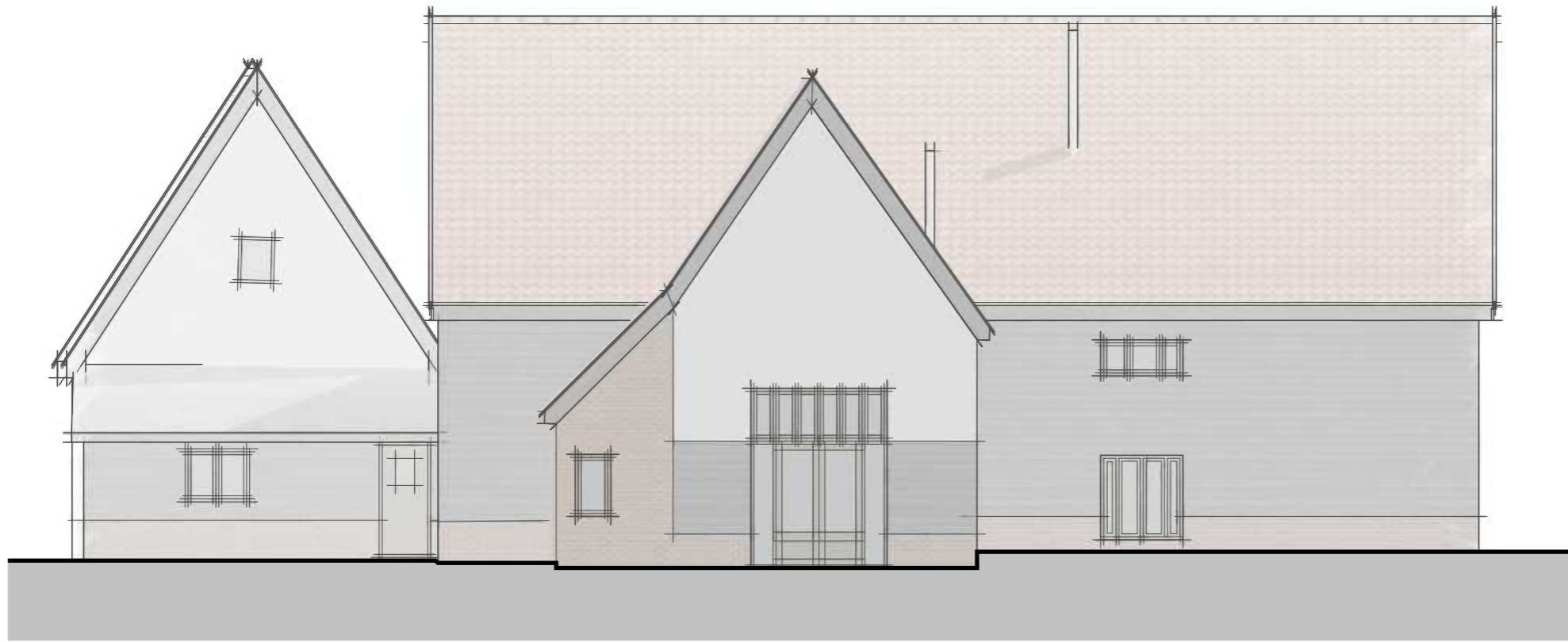
2 - North-west Elevation - Unaffected Scale 1:100 at A3