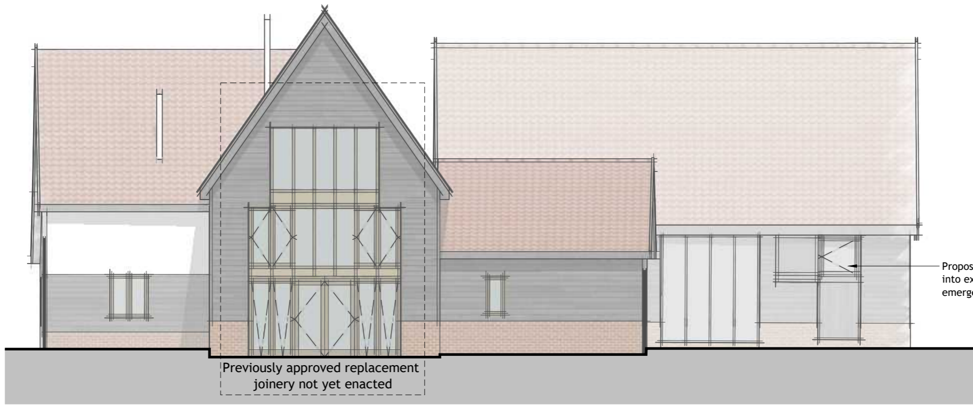
1 - South-west Elevation - As Proposed Scale 1:100 at A3