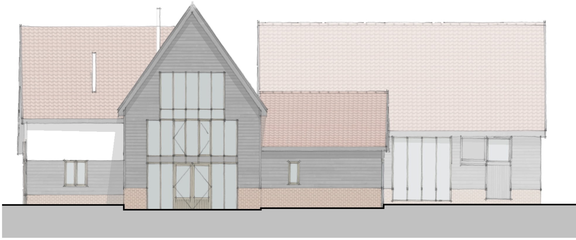
1 - South-west Elevation - As Existing Scale 1:100 at A3