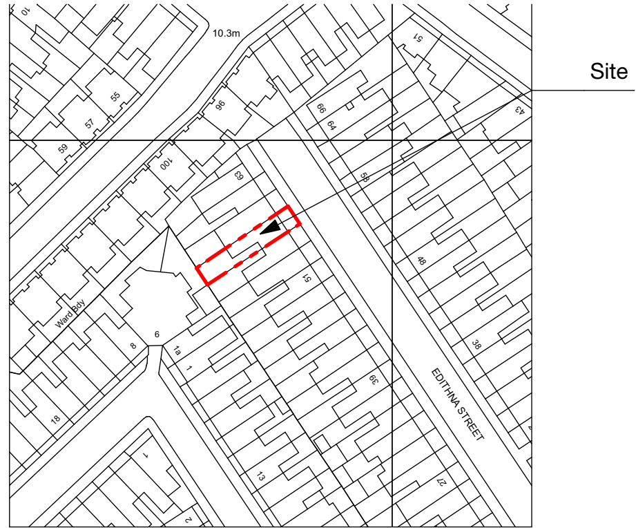
01 Location Plan 1:1250