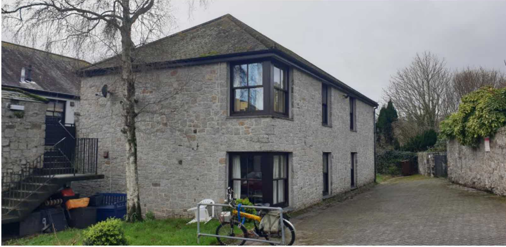
Figure 2 – Photograph showing flat complex to the North.