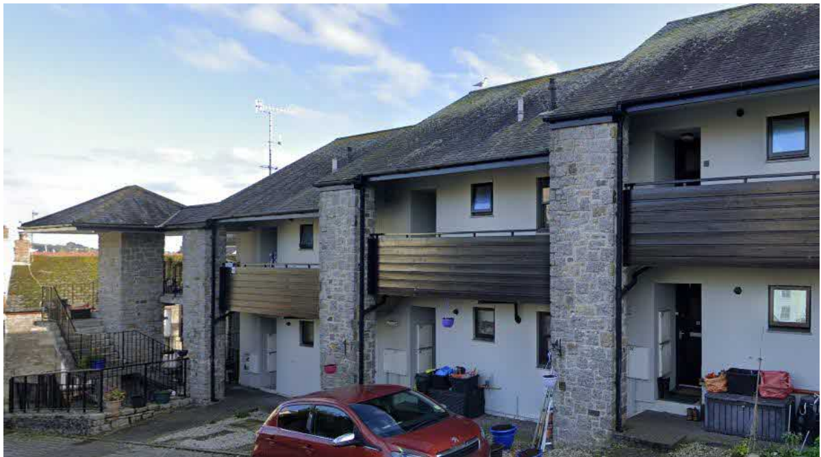
Figure 1 - Photograph showing entrance to Flats 1-22 Charter Close

ON: FLATS 1-22 CHARTER CLOSE, PENRYN, TR10 8LZ FOR: CORNWALL HOUSING LTD DATE: SEPTEMBER 2023 PREPARED BY: A JOHNSON CHECKED BY: J A TAYLOR B.Sc (Hons) Assoc RICS