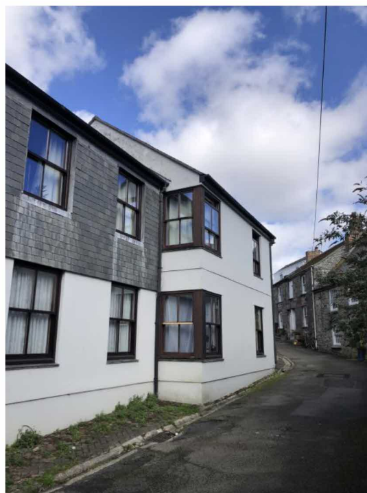
Figure 4 – Photograph showing flat complex to the South.