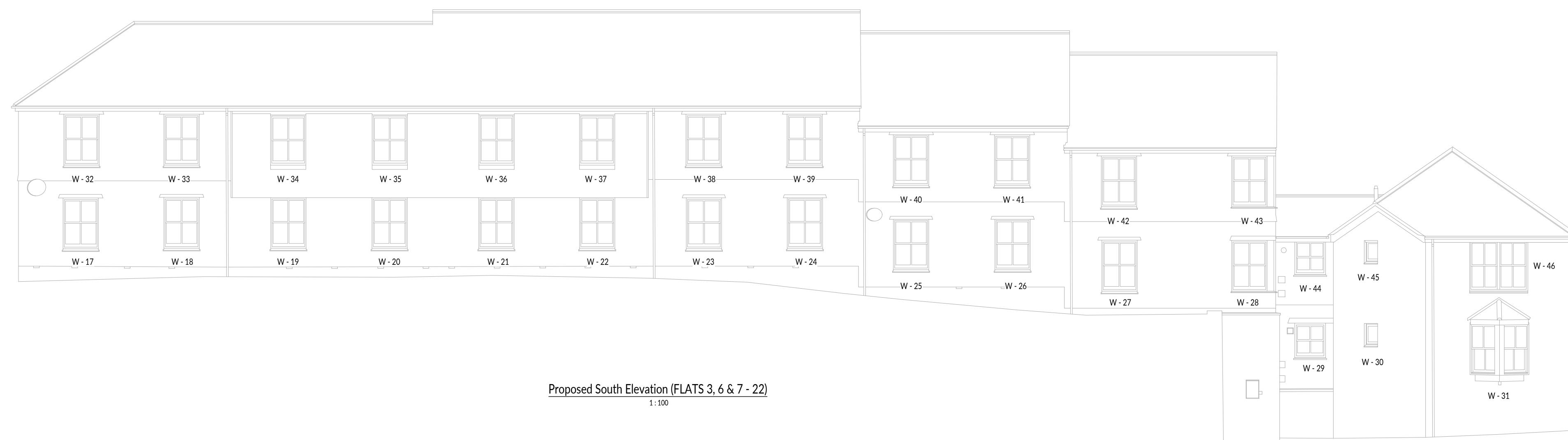
Proposed South Elevation (FLATS 3, 6 & 7 - 22) 1:100

All windows to be replaced with timber framed double glazed units matching existing style and colour. All doors to be replaced with units of similar appearance having double glazed vision panels.