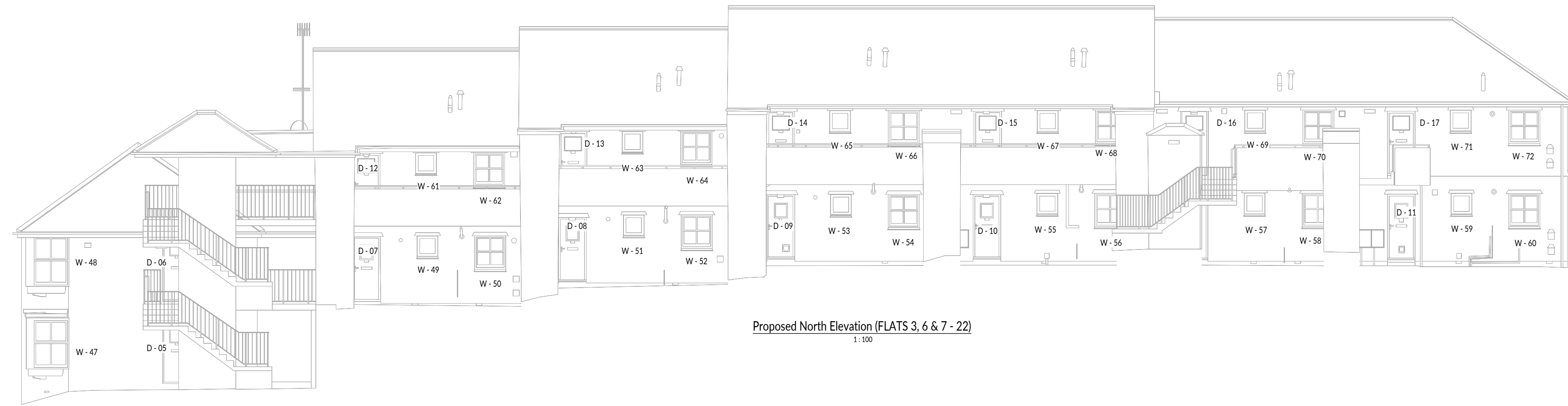
Proposed North Elevation (FLATS 3, 6 & 7 - 22) 1:100