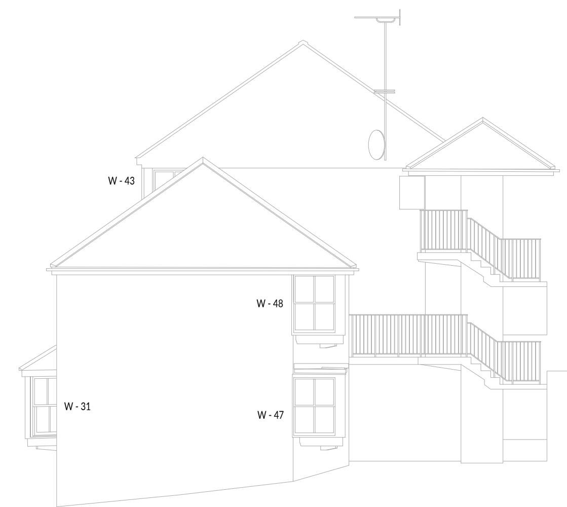
Proposed East Elevation (FLATS 3, 6 & 7 - 22) 1:100