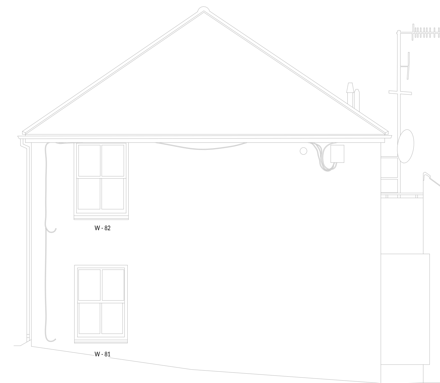
Existing West Elevation (Flats 13 - 16) 1:50