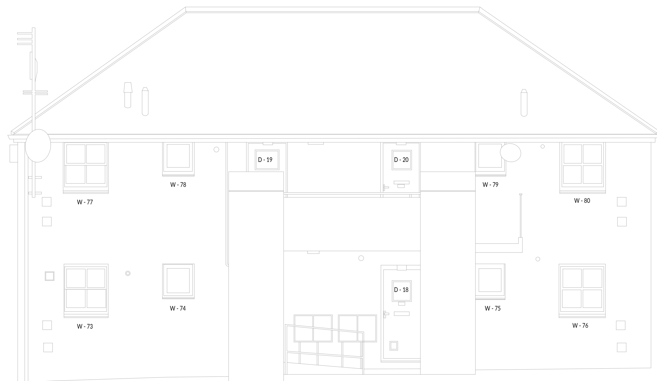
Existing South Elevation (Flats 13 - 16) 1:50

All existing windows and door vision panels currently single glazed.