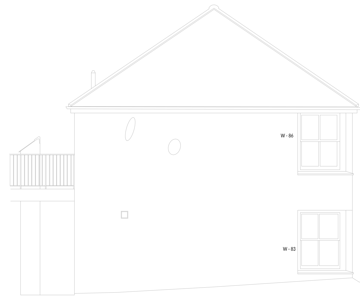
Existing East Elevation (Flats 13 - 16) 1:50

All existing windows and door vision panels currently single glazed.