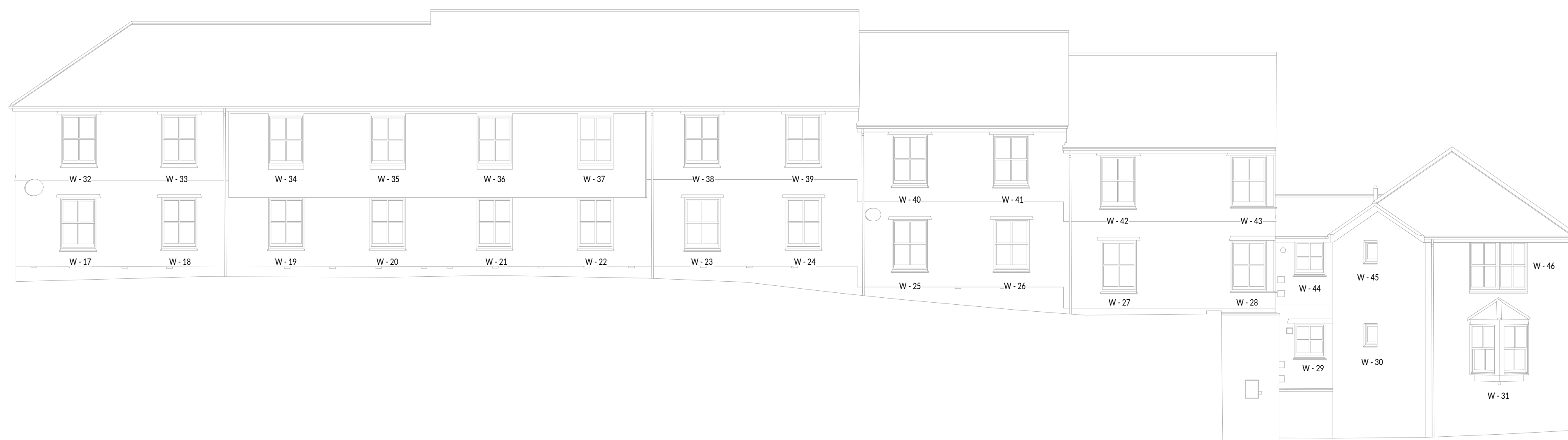
Existing South Elevation (FLATS 3, 6 & 7 - 22) 1:100