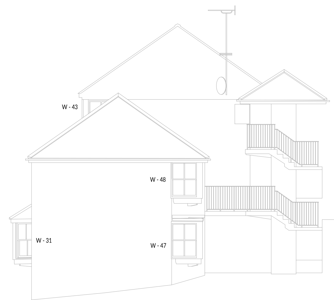
Existing East Elevation (FLATS 3, 6 & 7 - 22) 1:100

All existing windows and door vision panels currently single glazed.