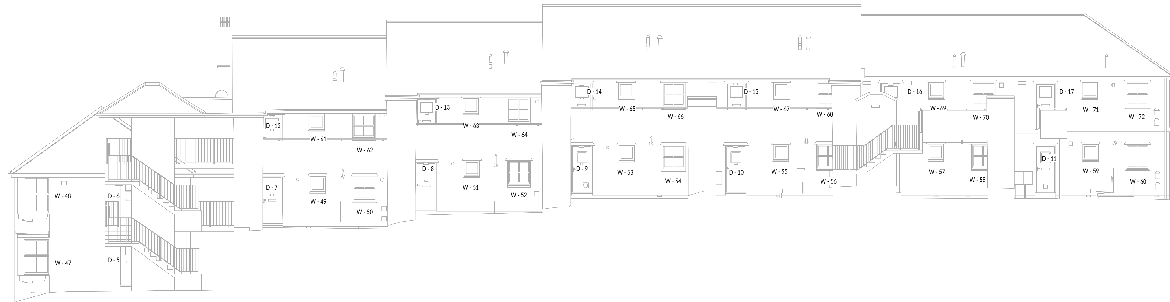
Existing North Elevation (FLATS 3, 6 & 7 - 22) 1:100

All dimensions in millimetres unless noted otherwise. Do not scale from drawings for construction purposes. All dimensions to be checked on site. All details and dimensions relating to the sub-contractors or suppliers work must be checked and agreed between the sub-contractors or suppliers and the general contractor. This drawing is to be read in conjunction with all other planning documentation. Works to comply with current Codes of Practice, Eurocode, British standards and building regulation. Planning Drawing - Not for construction