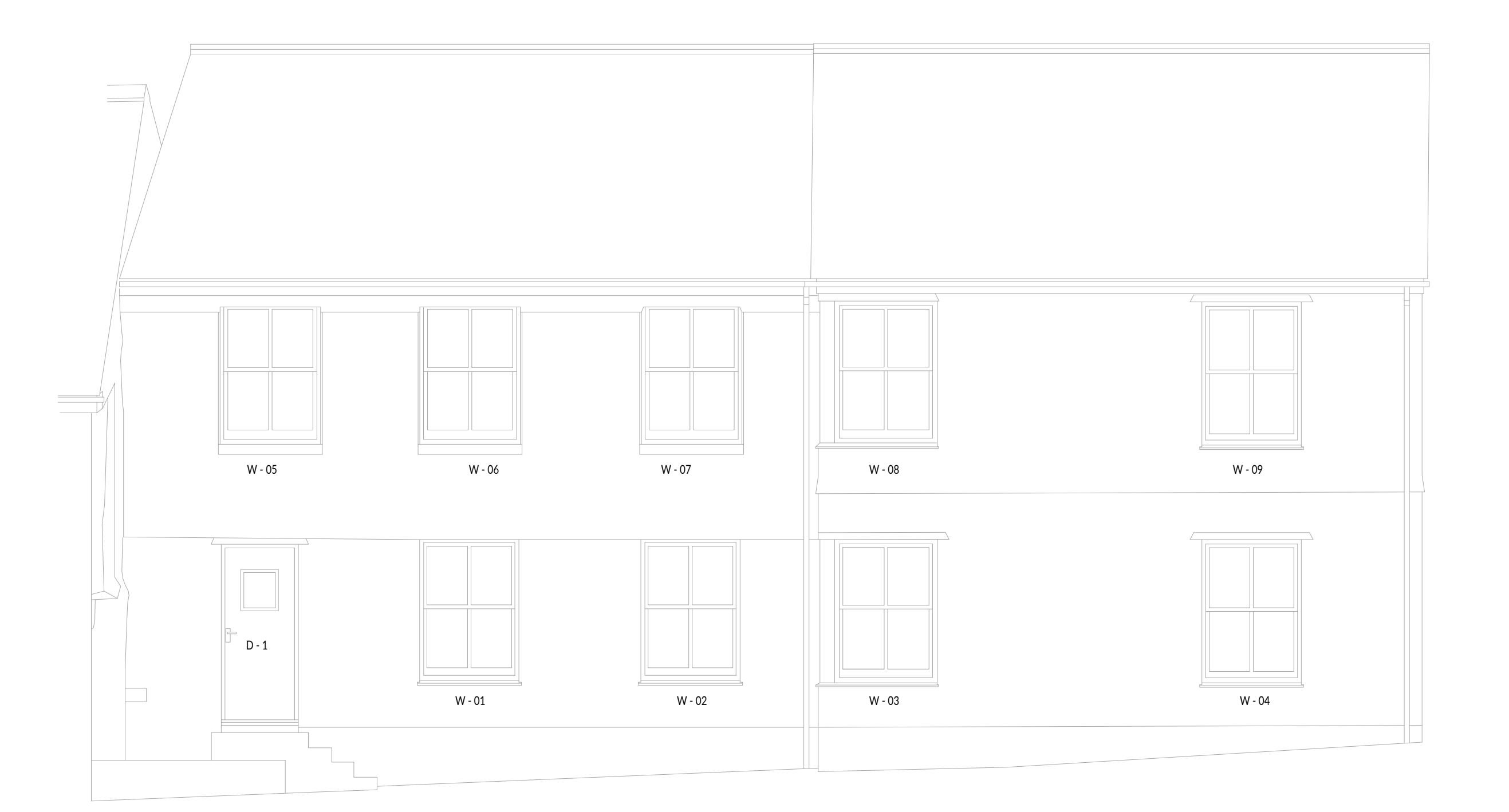
Existing South East Elevation (FLATS 1, 2, 4 & 5)

All existing windows and door vision panels currently single glazed.