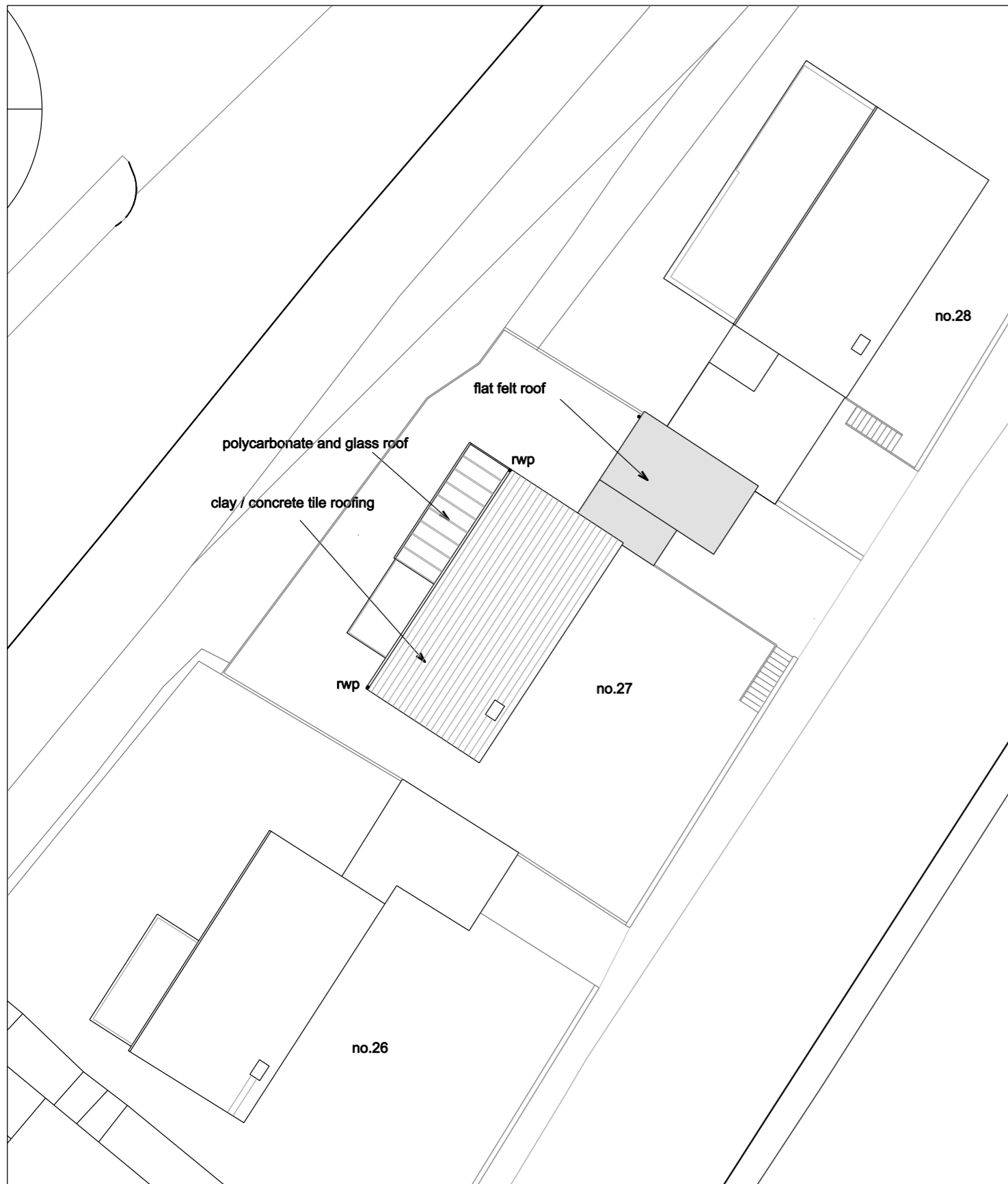
Existing roof plan