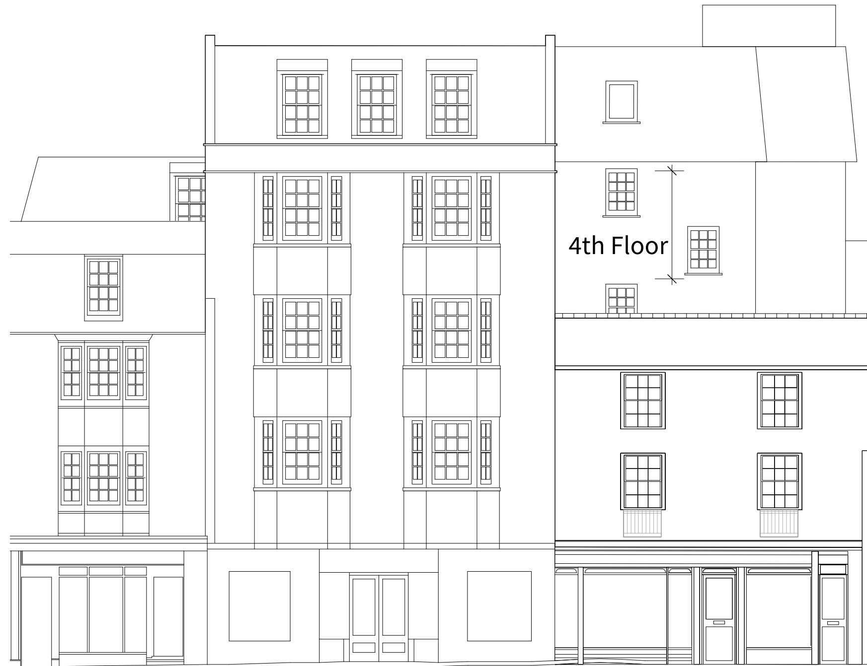
Proposed West Elevation from Market St

Note. survey by others, dimensions to be checked on site. Drawing indicative for planning purposes only.