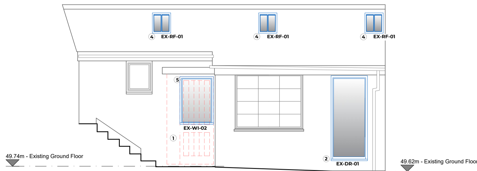
NORTHEAST ELEVATION - PROPOSED