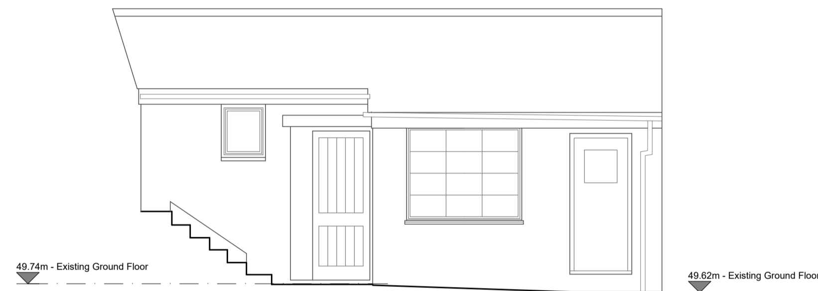
NORTHEAST ELEVATION - EXISTING