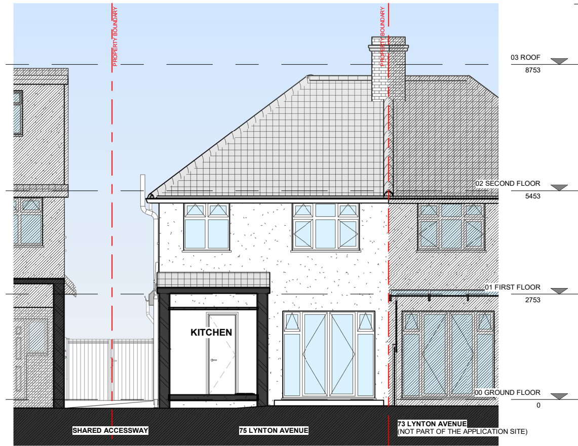
S2 - Cross Section - Existing 1 : 100