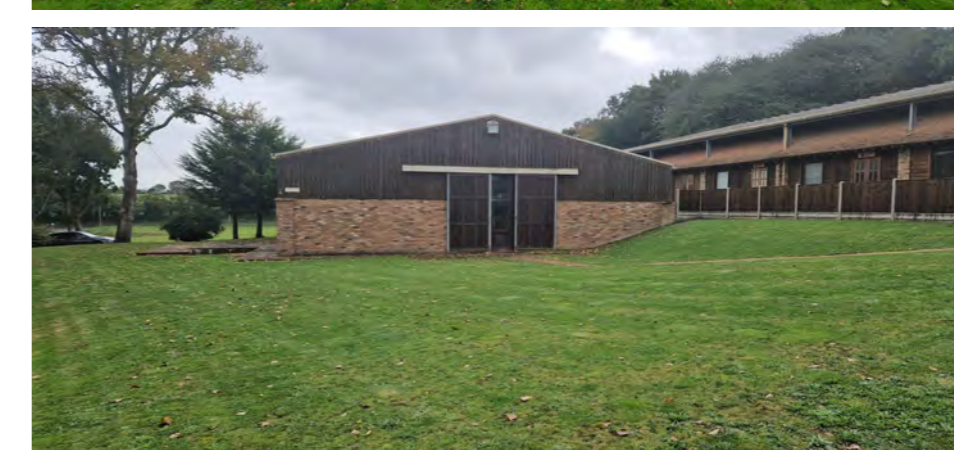
SITE PHOTO @ N.T.S

All Dimensions, Setting out & Levels must be checked on site and refer to Setting out points and Ordnance Datum Newlyn unless alternative Datum criteria given. This drawing must not be scaled - used for land transfer purposes - used on site unless issued for construction and must be read in conjunction with the relevant specification clauses. Calculated areas in accordance with most Definition of Areas for Schedule of Areas Subject to survey and consultation with the Local Authority planning department. All survey information taken from site dimensions and photographs and not an electronic survey. Recommended an electronic survey be carried out prior to proposals. Levels are indicative only.