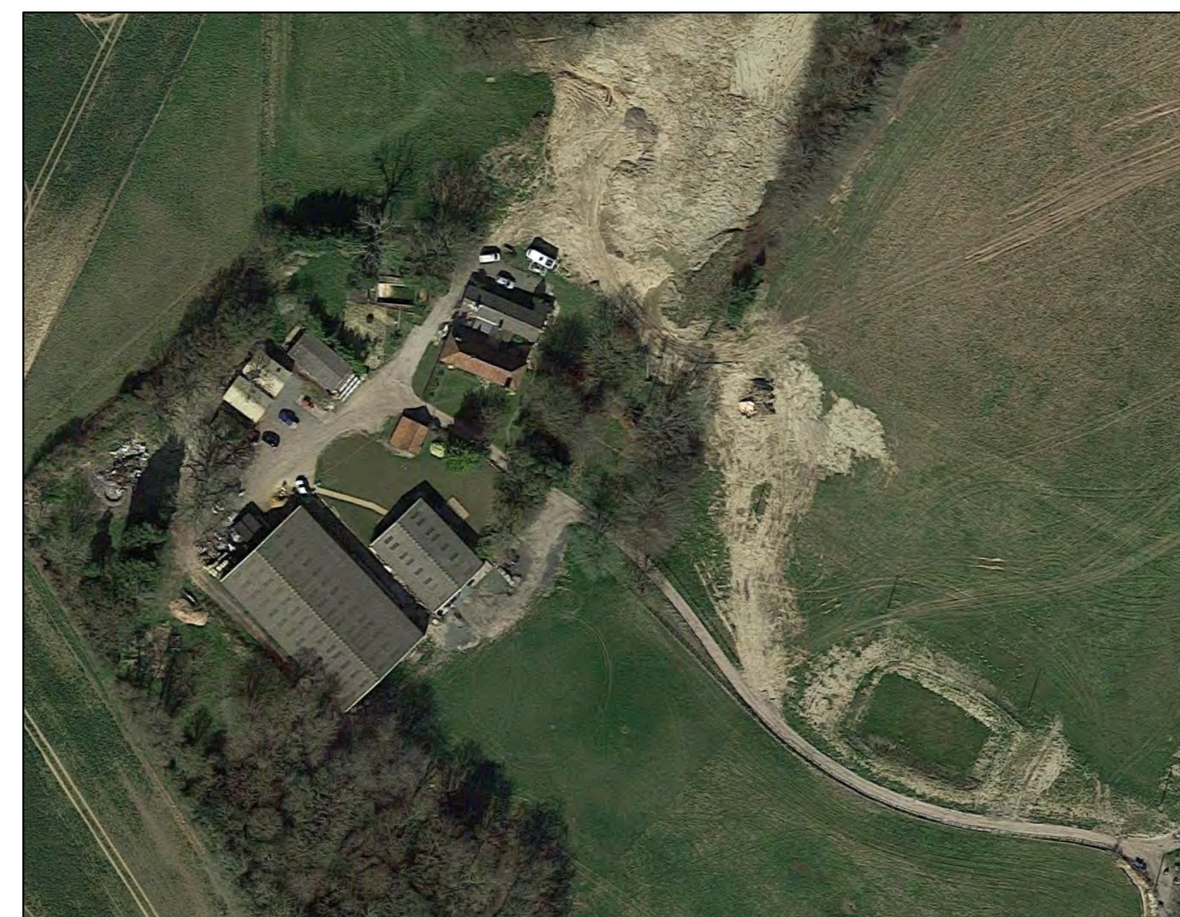
AERIAL PHOTO @ N.T.S