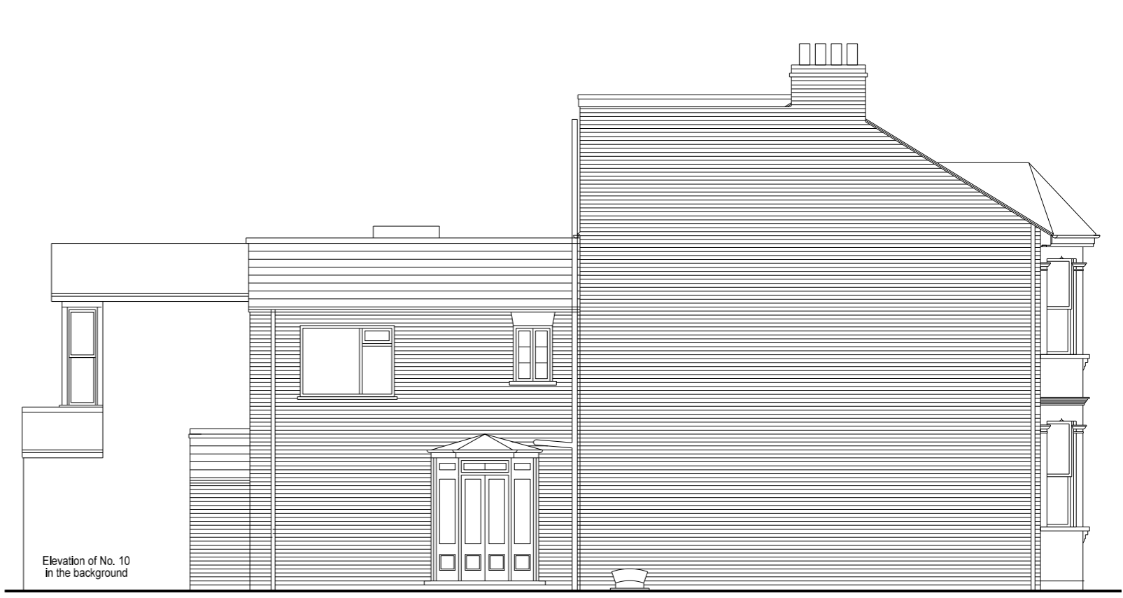
SIDE ELEVATION facing No.14