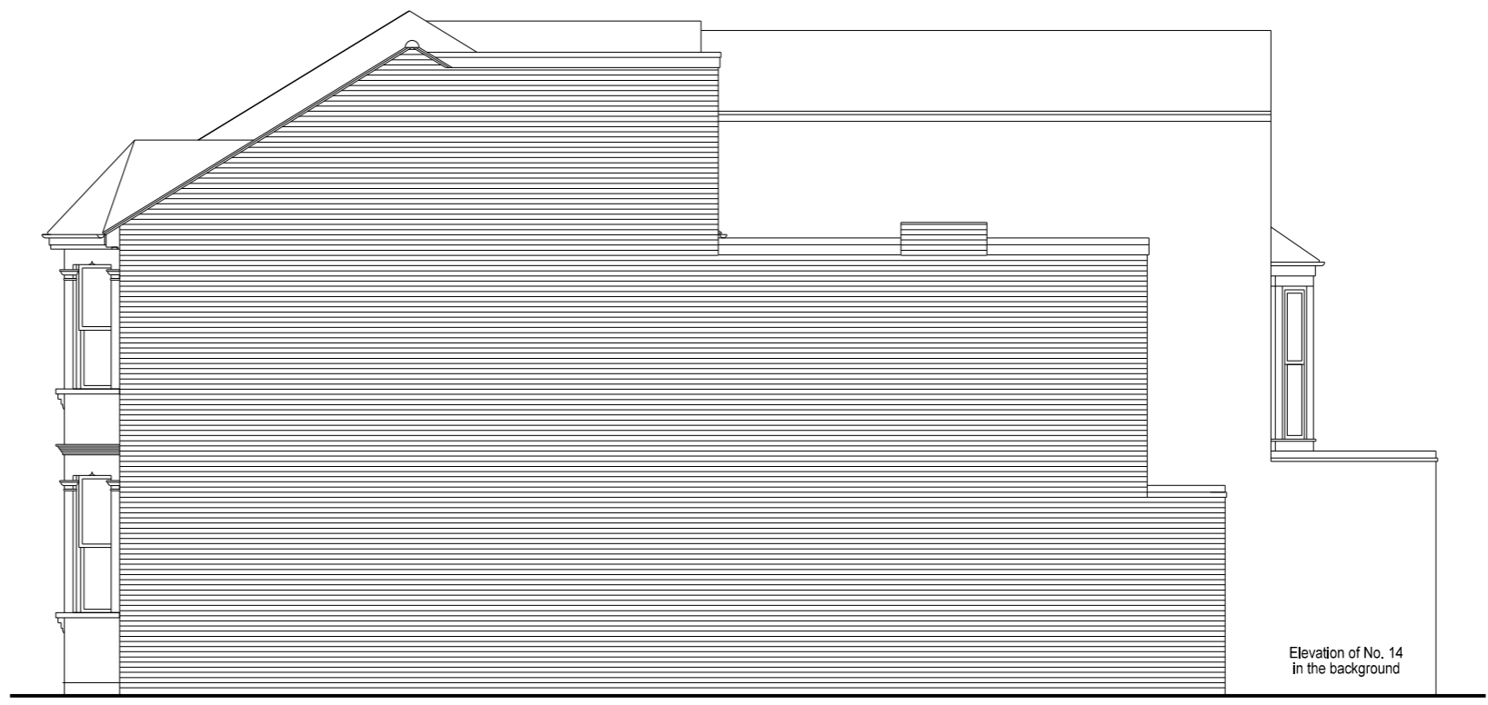
SIDE ELEVATION facing No.10