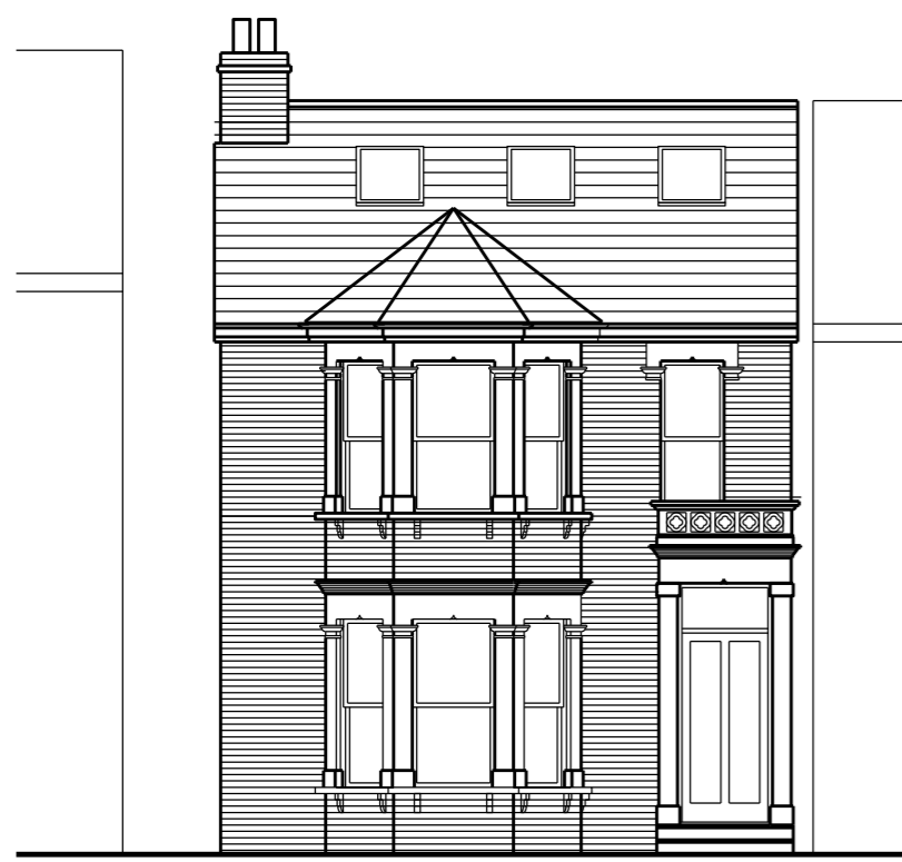
FRONT ELEVATION as existing