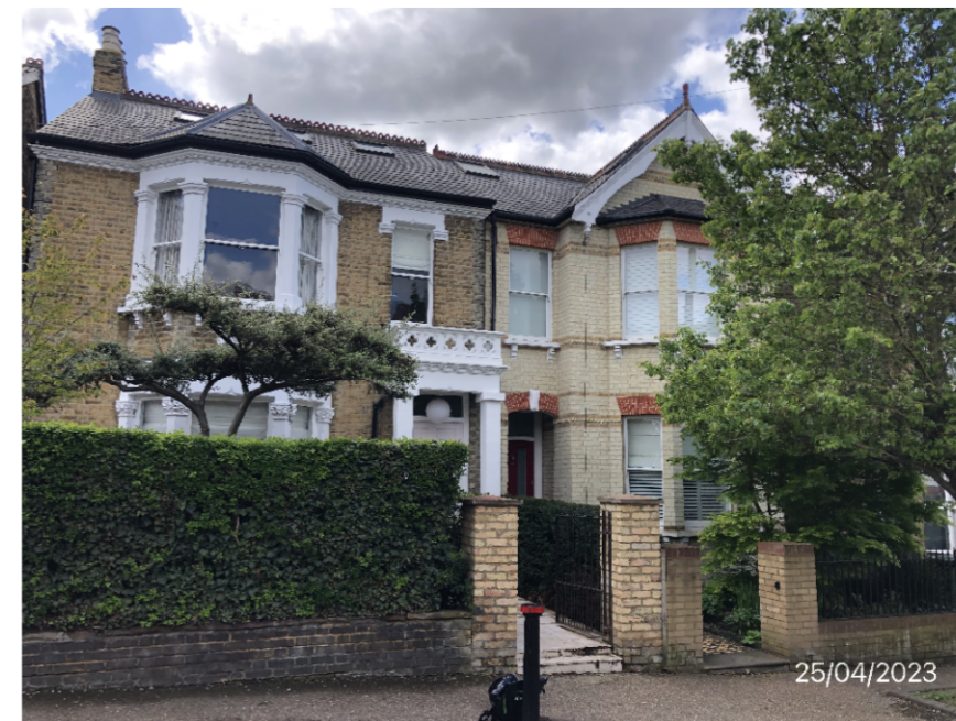
VIEW TOWARDS No. 10