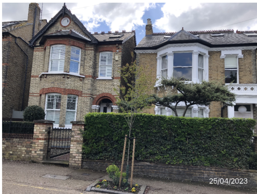
VIEW TOWARDS No. 14