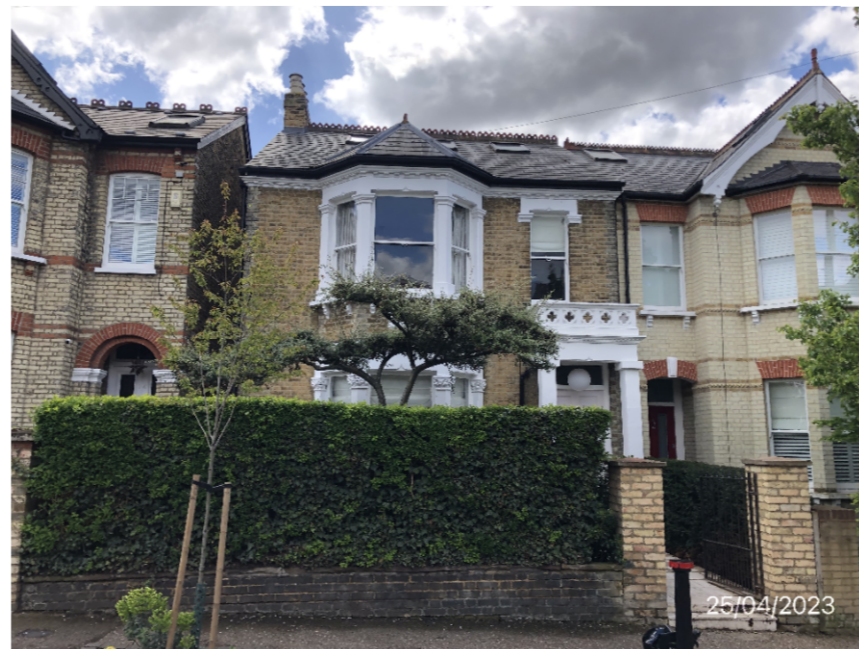
FRONT ELEVATION No.12