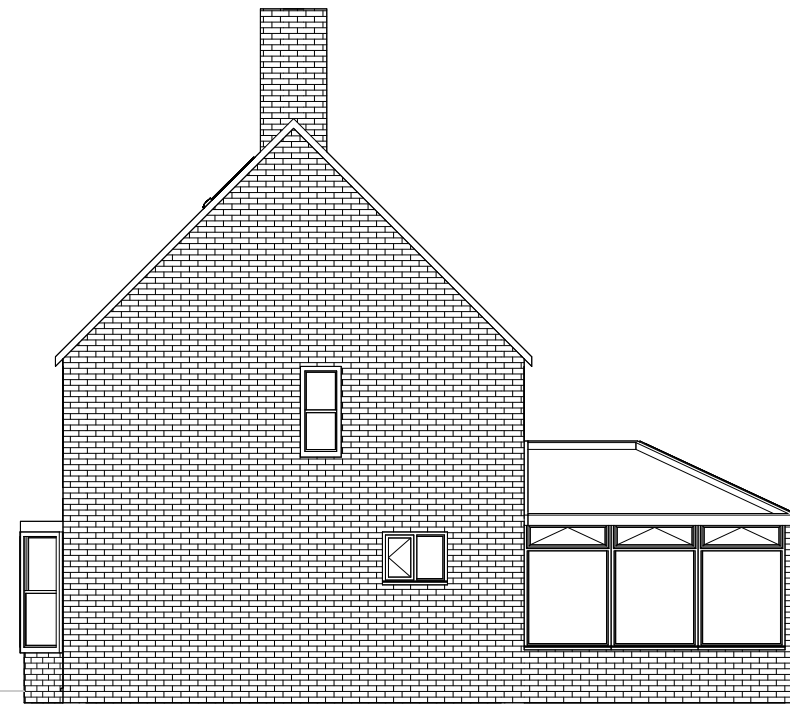
3 Existing Side A Elevation 1 : 100