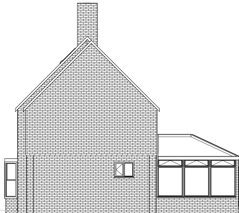
4 Proposed Side A Elevation 1 : 100

Do not scale from the drawings. FOR PLANNING PURPOSES ONLY Dimensions to be checked on site, where discrepancies occur, seek advice from the client's representative for clarification. The drawings & specifications are a guide as to what is required to comply with the current building regulations. This does not imply that this is the only acceptable way of achieving building regulations approval. Alternative 'similar approved' products may be used at the discretion of the Building Inspector. No liability is accepted for any loss of any sort or additional expense incurred consequent on any variation to the layout or specification that may be required as a result of site conditions, availability of materials, custom or practice, the requirements of the Building Inspector or any other circumstances.