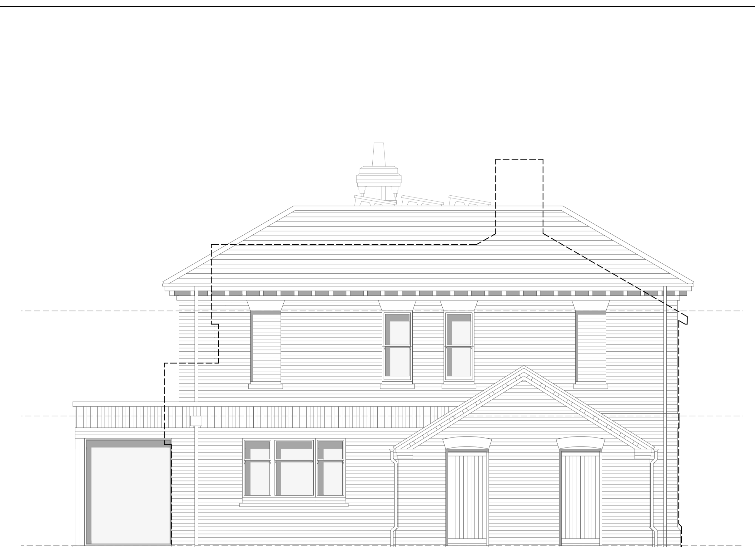
SIDE ELEVATION proposed | west 1:50