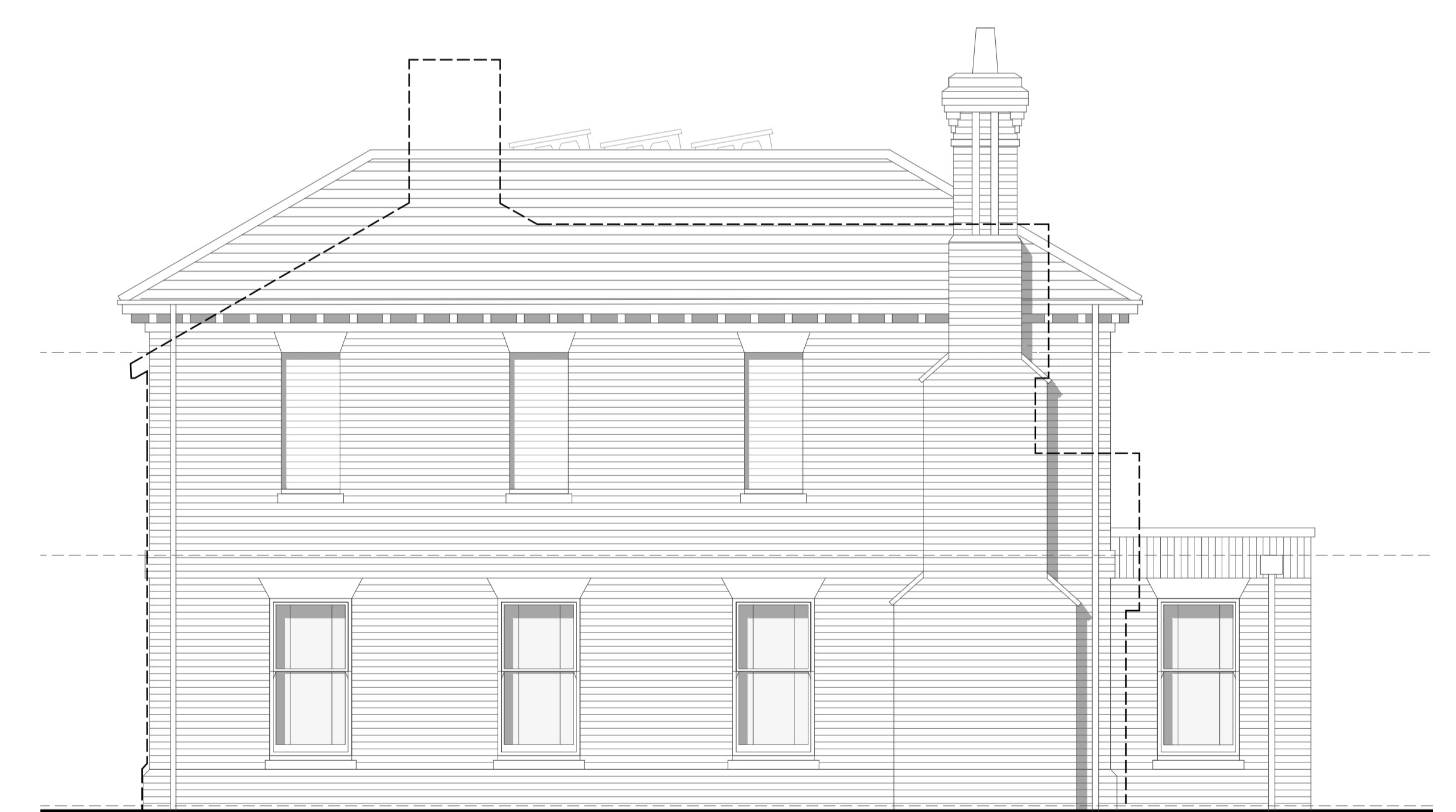
SIDE ELEVATION proposed | east 1:50