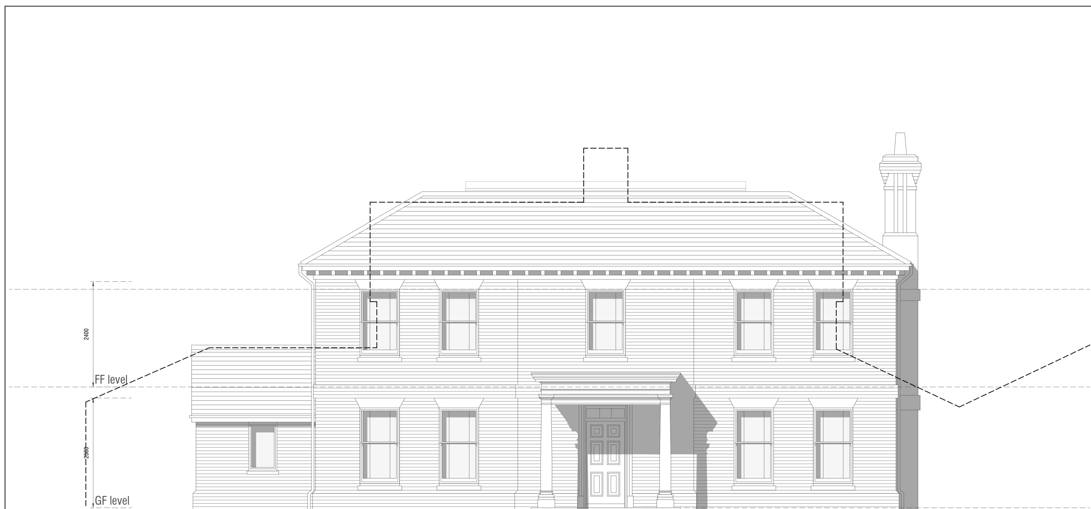
FRONT ELEVATION proposed | south 1:50