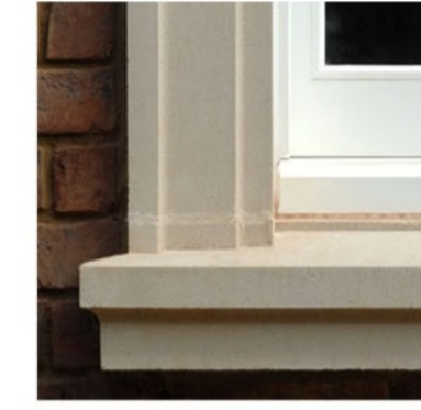
CAST STONE Entrance porch, window cills and coping stones