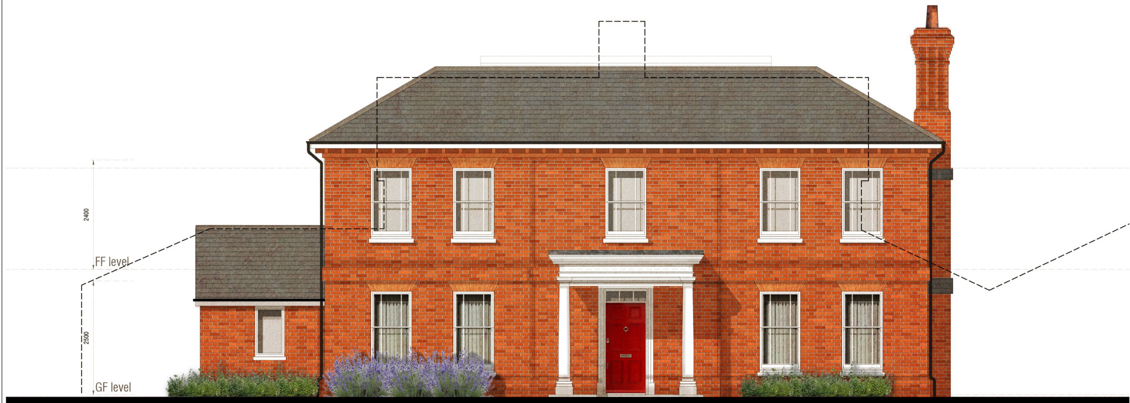
FRONT ELEVATION proposed | south 1:50