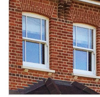
SASH WINDOWS Traditional timber sashes