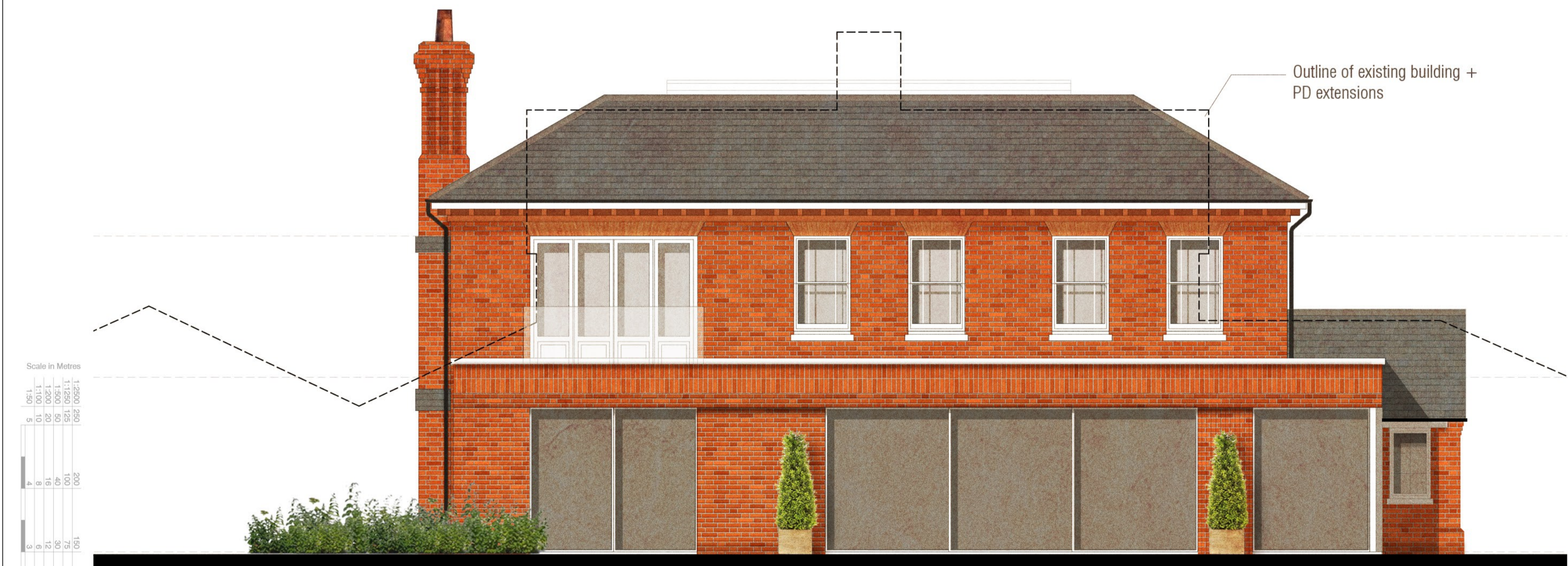
REAR ELEVATION proposed | north 1:50