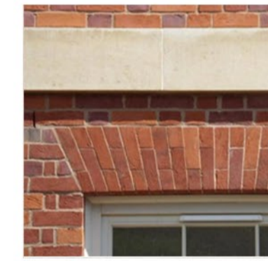
FLAT ARCH BRICK HEADS