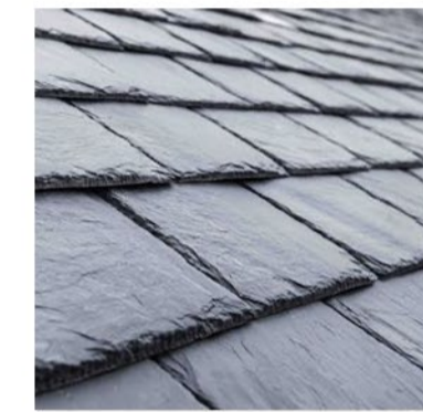
SLATE Natural Slates