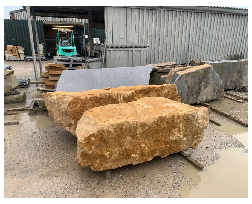
(Left) Doulting stone proposed for window surrounds.

New surrounds are to be made to accurately match the existing profiles.