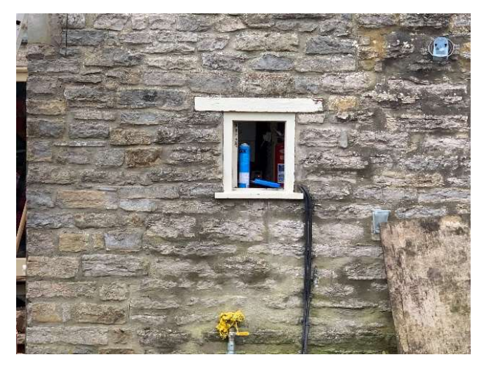
(Left): The existing natural stone walls. For reference.