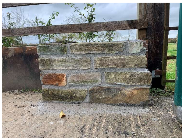
(Above): Two samples of the proposed Natural stone. (Mortar Mix Elsewhere)