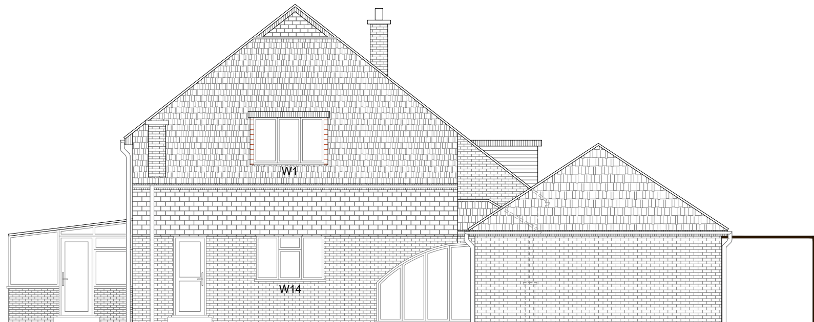
EXISTING SIDE ELEVATION-2