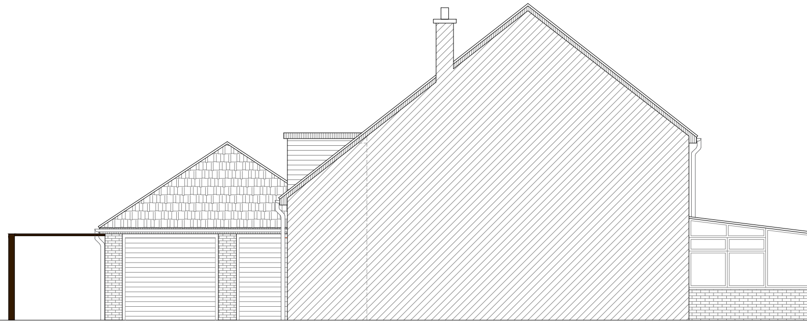
EXISTING SIDE ELEVATION-1