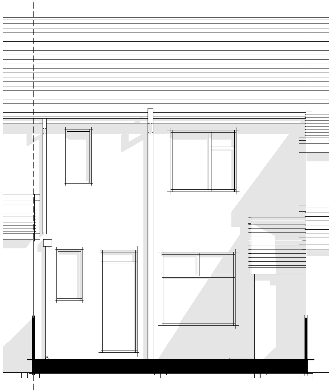
Existing Rear / South Elevation 1 : 50