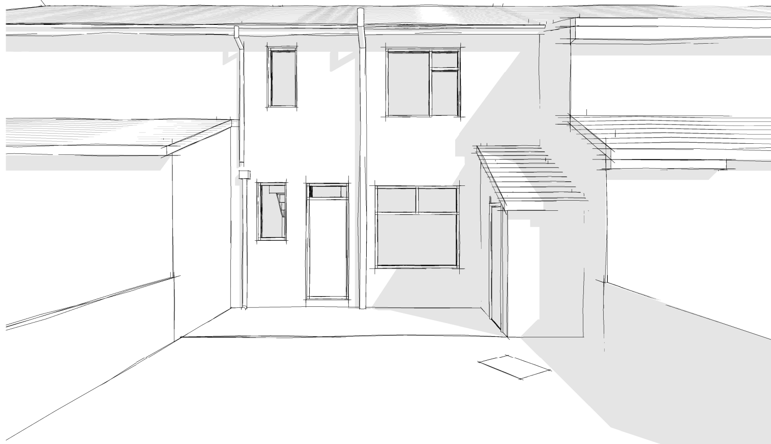
Existing Perspective View