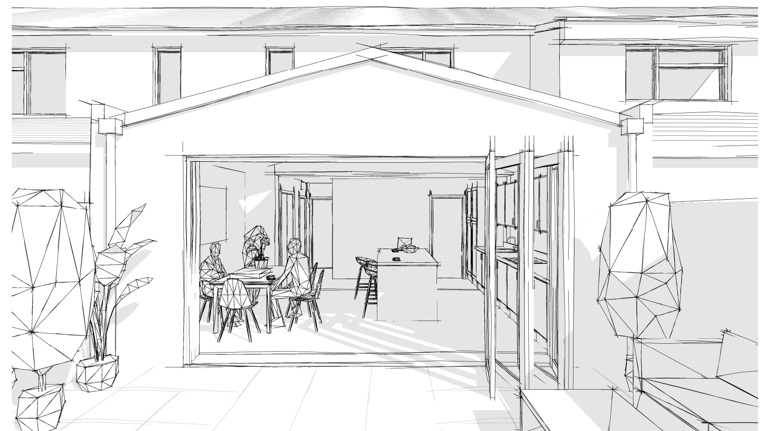
Proposed Perspective View