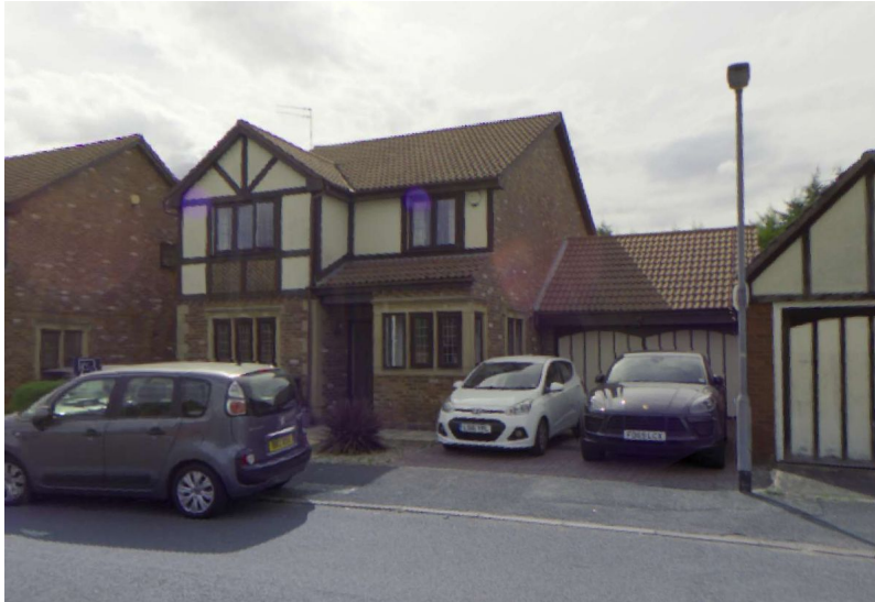
Front view and Driveway