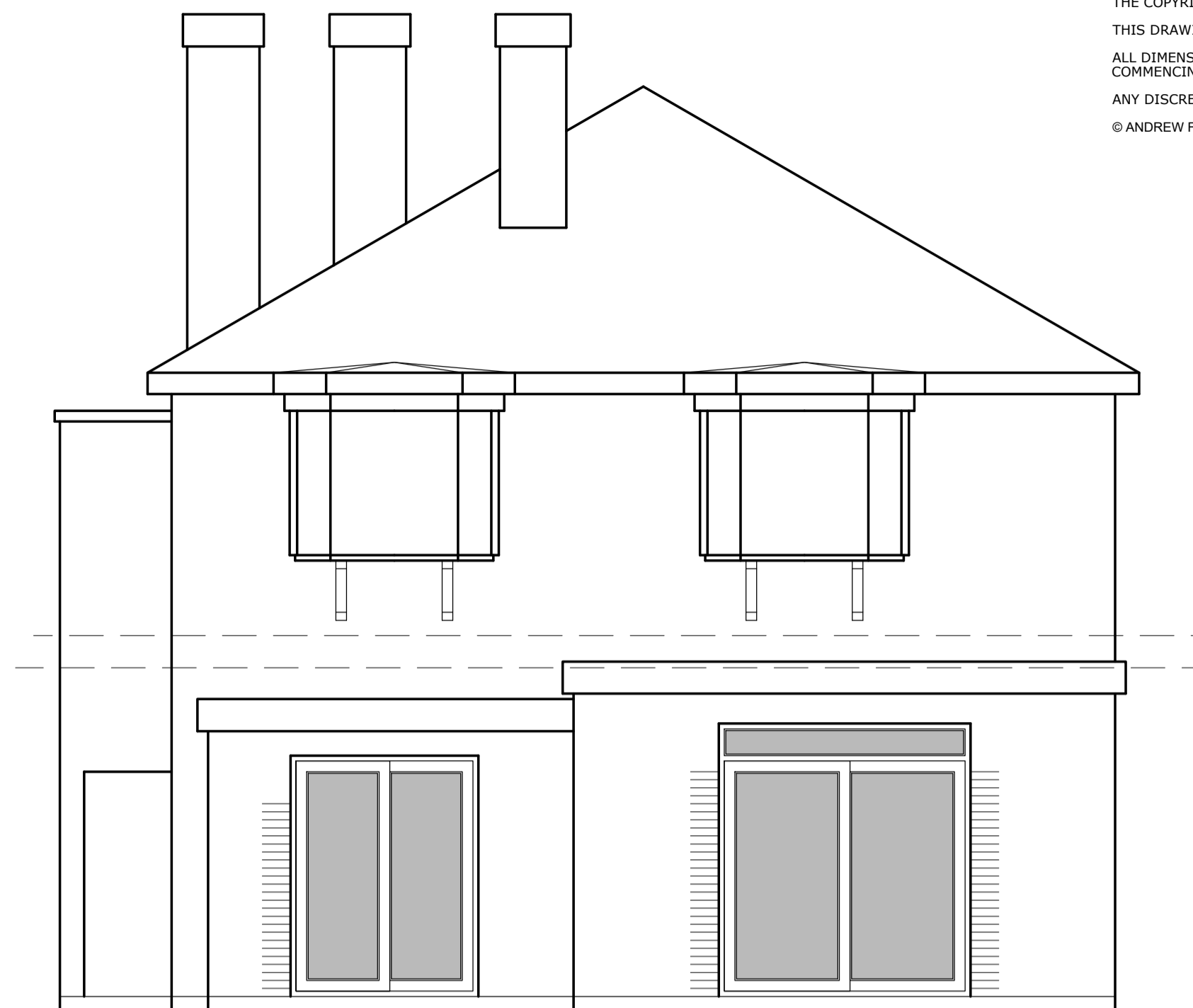
W E S T