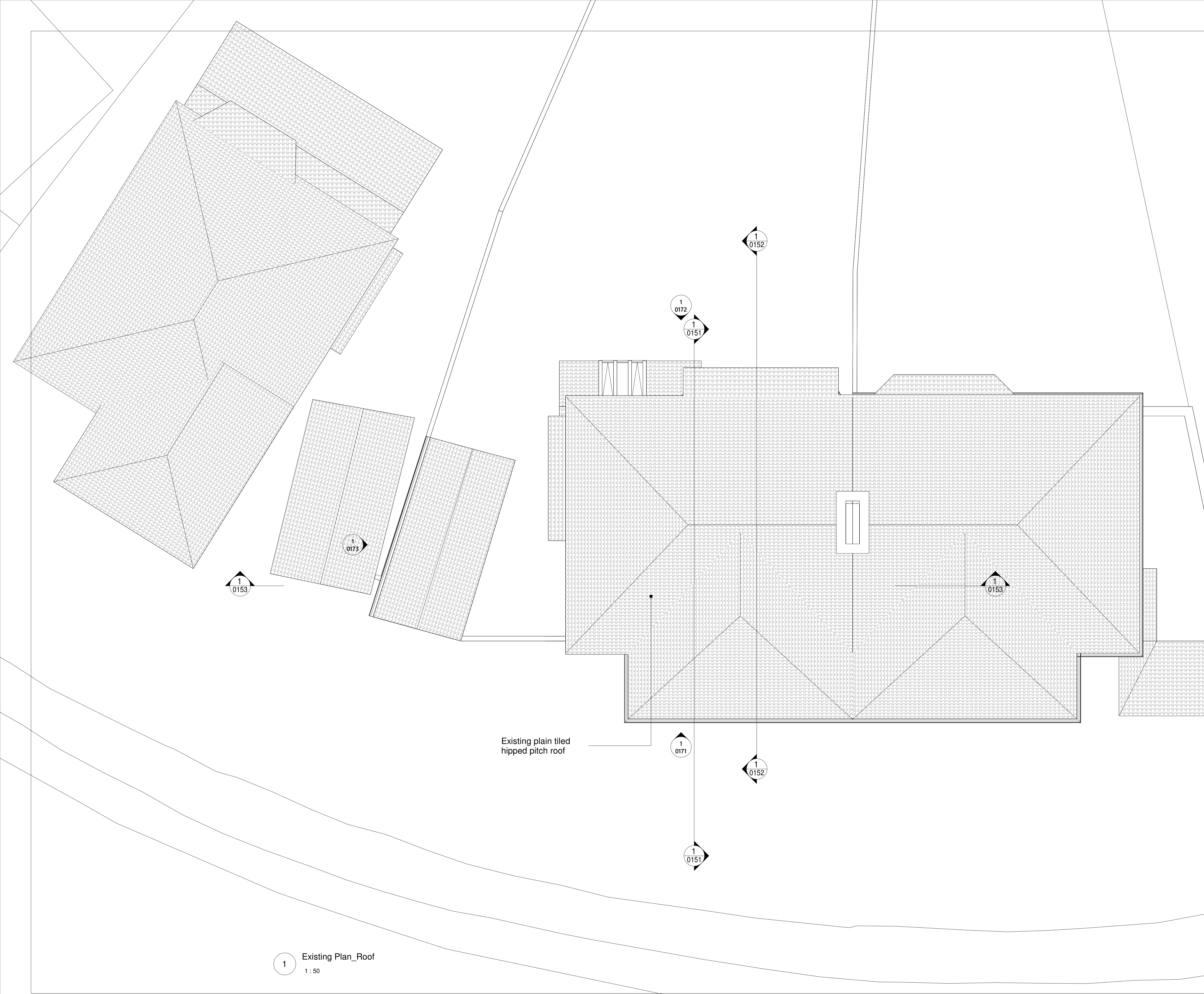
1 Existing Plan_Roof 1 : 50

Note: Revision clouds colours - Denotes 'changed / Revised' information - Denotes 'On hold / In abeyance' information