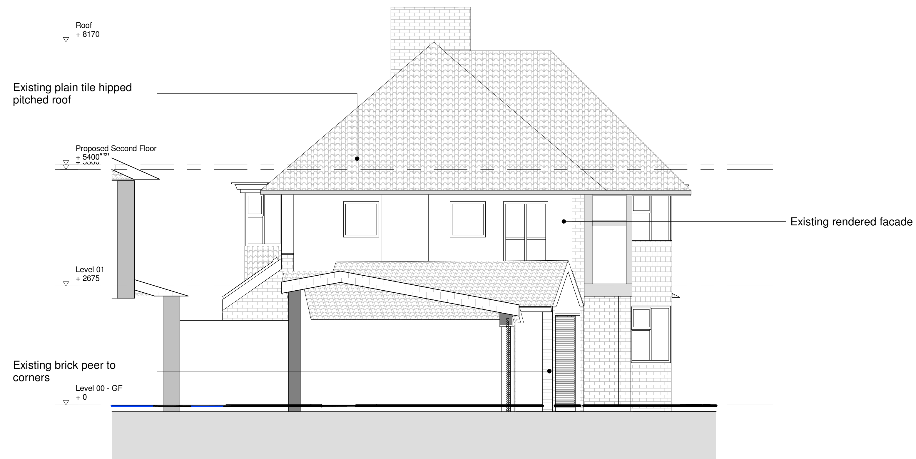
1 Existing Elevation_Side 1 : 50

Note: Revision clouds colours ○ Denotes 'changed / Revised' information ○ Denotes 'On hold / In abeyance' information