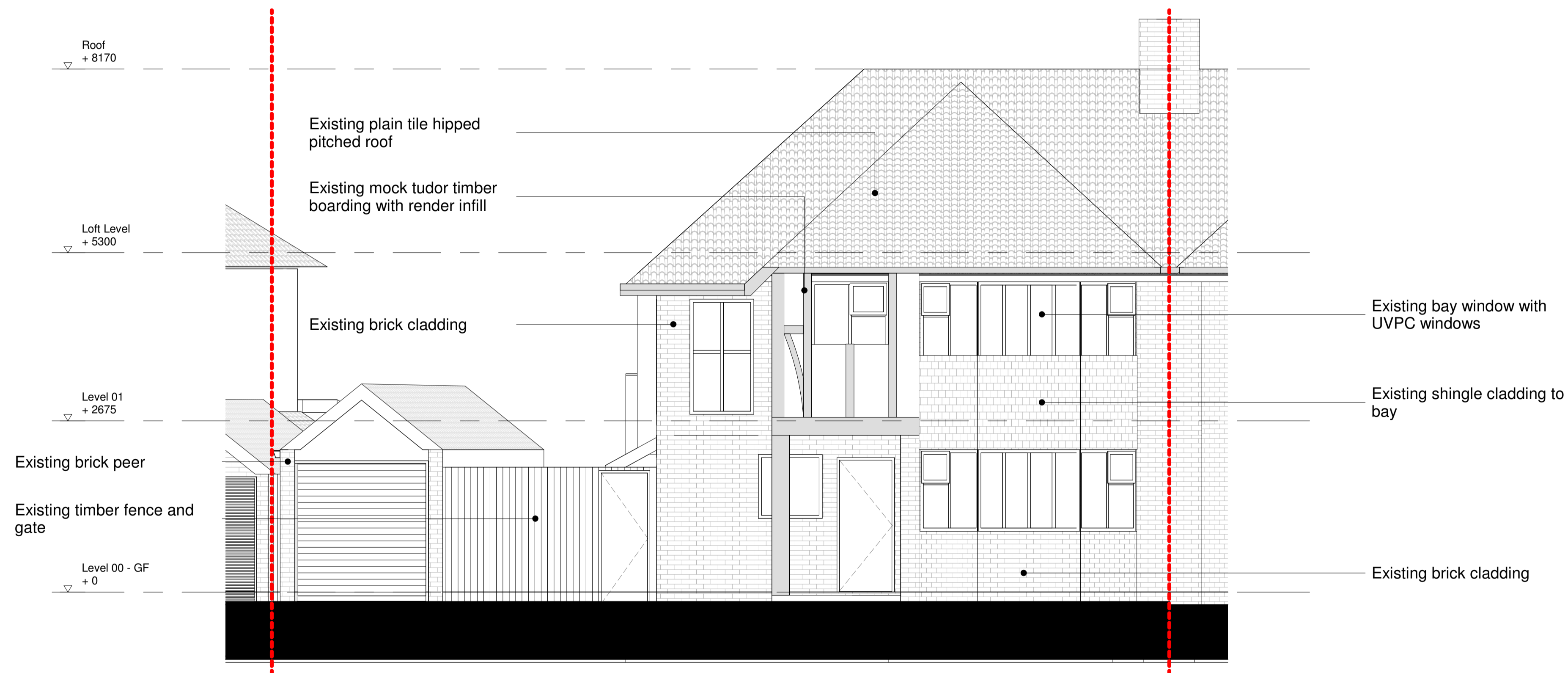
1 Existing Elevation_Front 1 : 50

Note: Revision clouds colours ○ Denotes 'changed / Revised' information ○ Denotes 'On hold / In abeyance' information