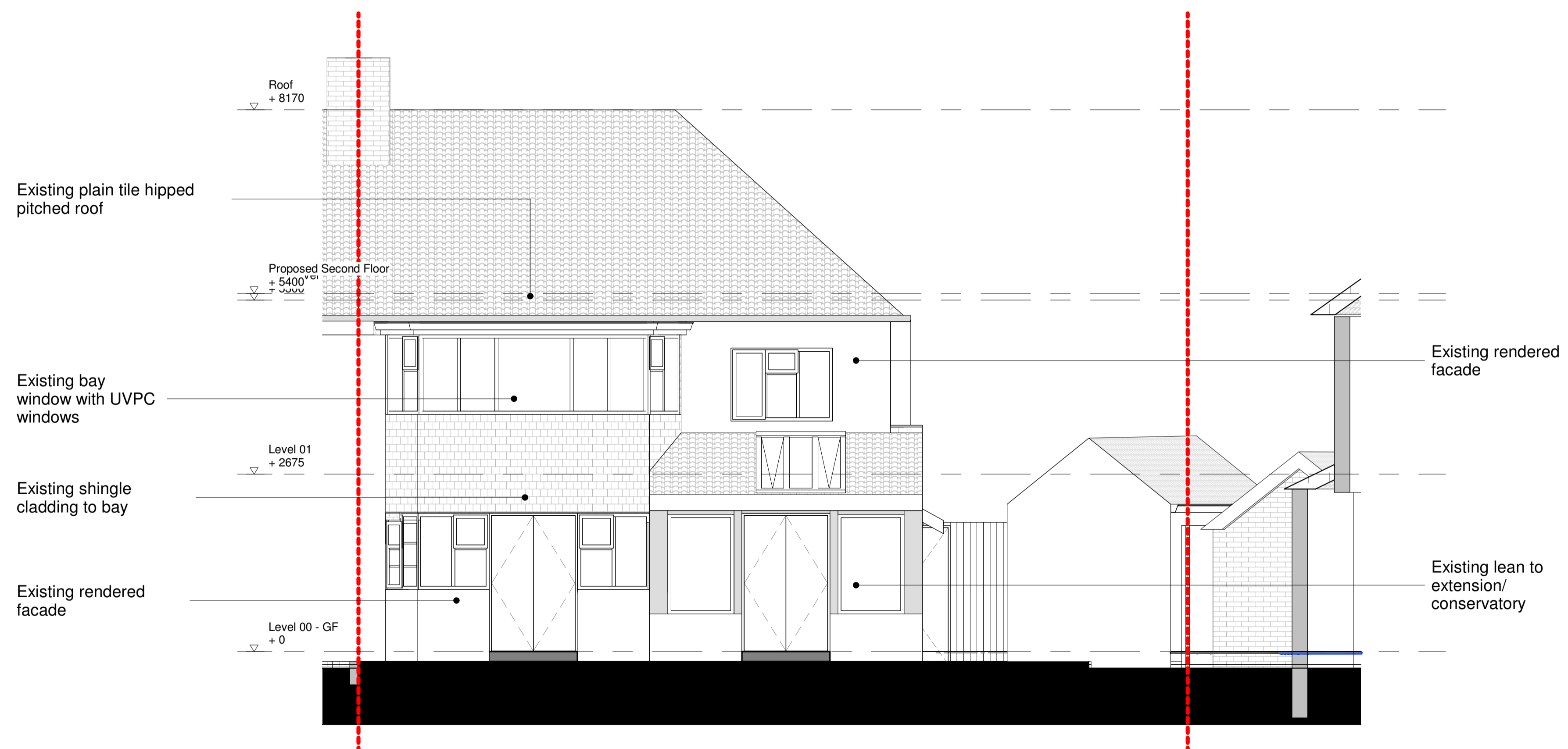
1 Existing Elevation_Rear 1 : 50

Note: Revision clouds colours ○ Denotes 'changed / Revised' information ○ Denotes 'On hold / In abeyance' information