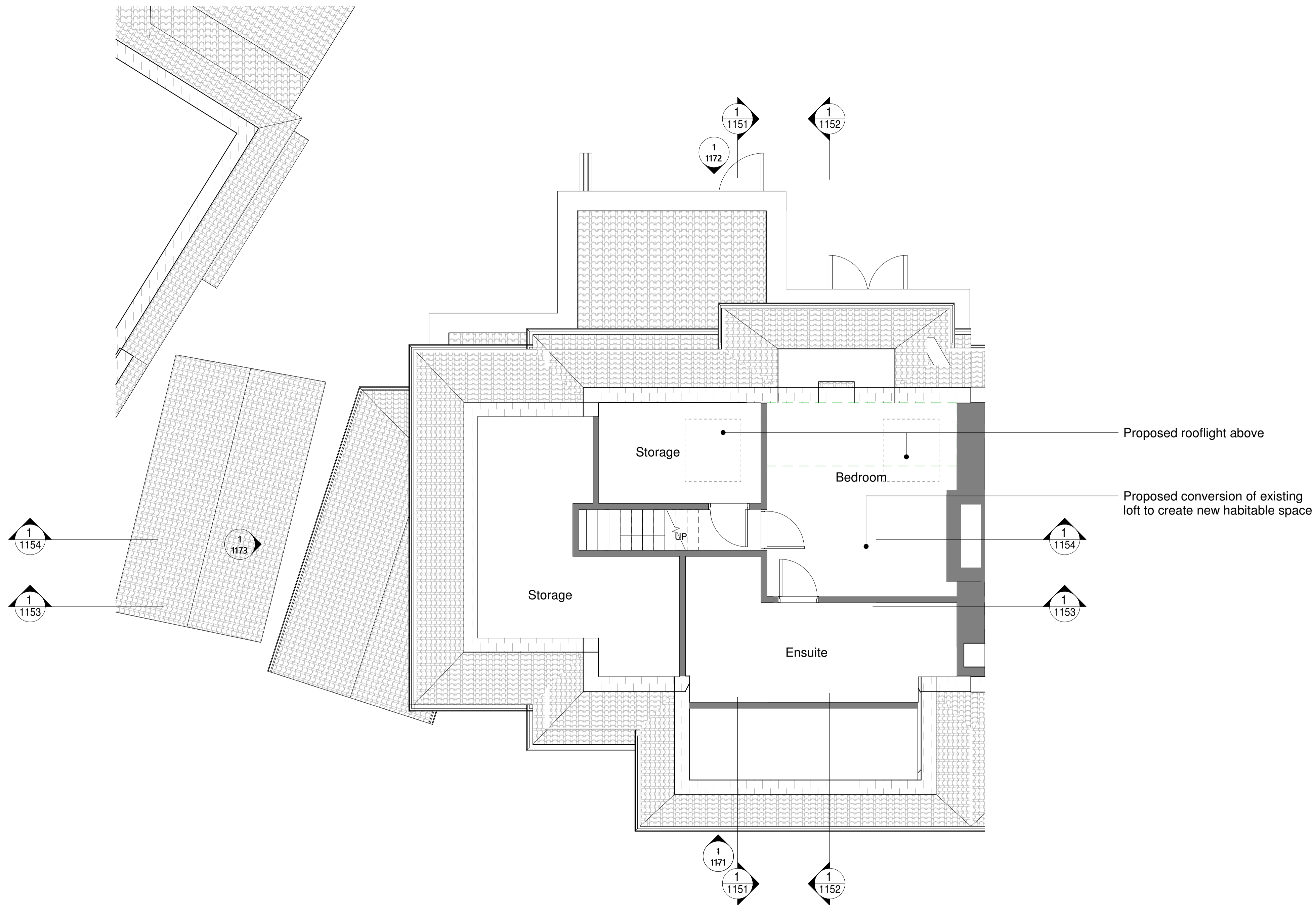
1 Proposed GA_Second Floor Plan_Level 02 1 : 50

Note: Revision clouds colours ○ Denotes 'changed / Revised' information ○ Denotes 'On hold / In abeyance' information