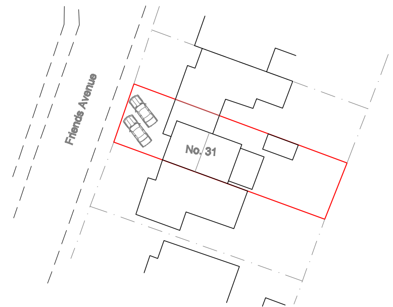
7a Existing Site Block Plan Scale: 1:500