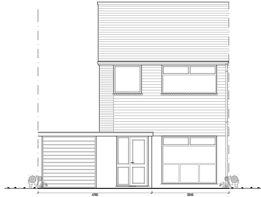
5a Existing Front Elevation Scale: 1:100