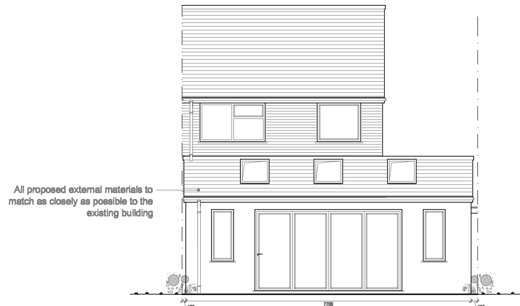
5d Proposed Rear Elevation Scale: 1:100