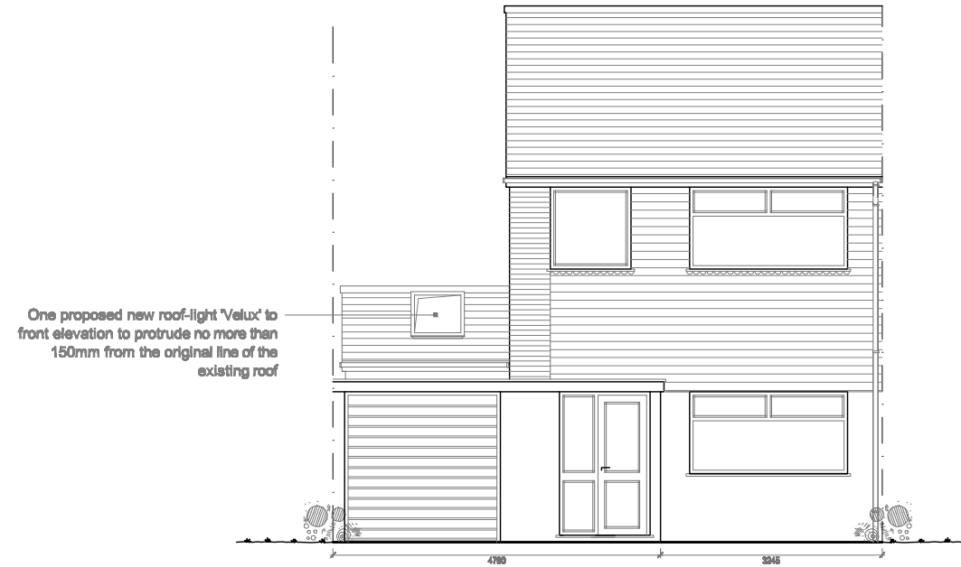
5b Proposed Front Elevation Scale: 1:100