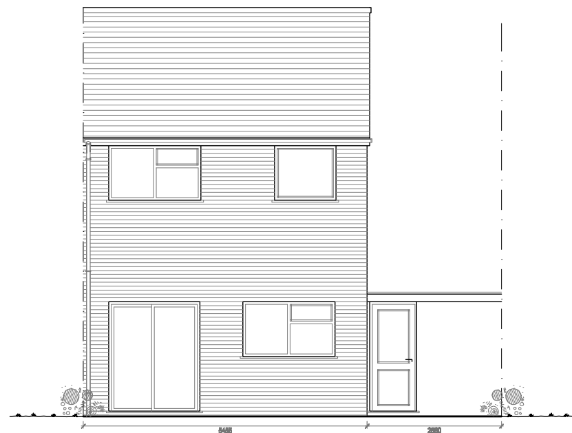
5c Existing Rear Elevation Scale: 1:100