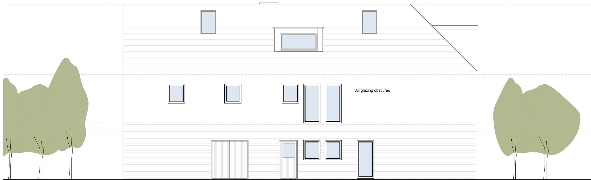
Proposed (north-east) Side Elevation 1:100