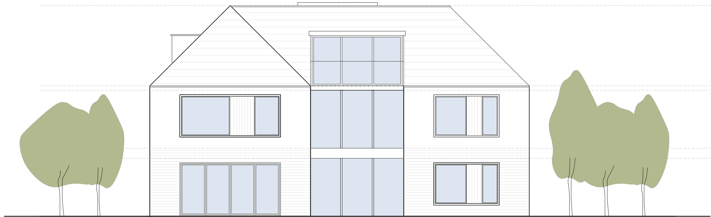
Proposed Rear (north-west) Elevation 1:100