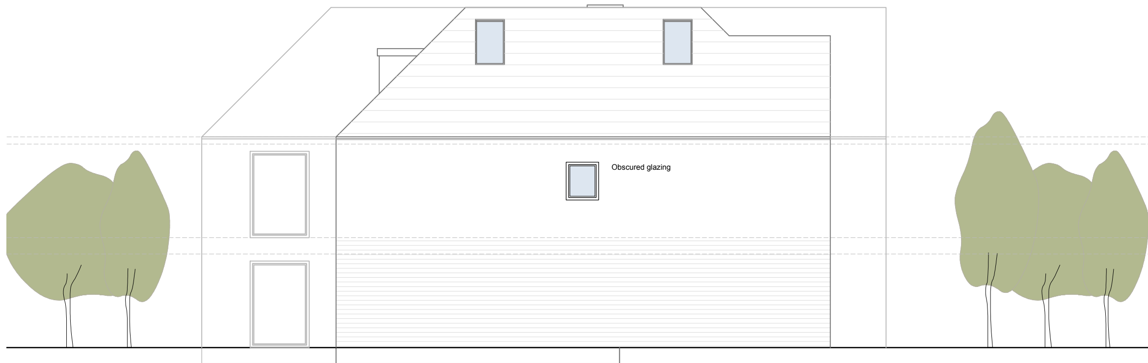
Proposed (north-west)Side Elevation 1:100