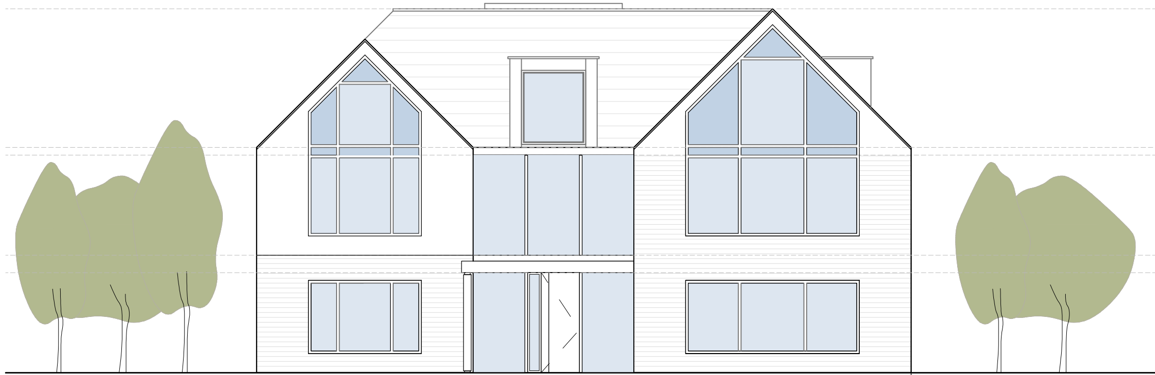
Proposed Front (south-east) Elevation 1:100