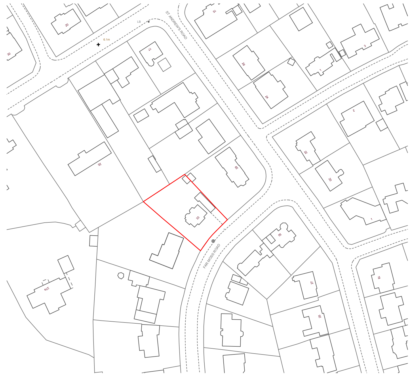
Location Plan @ 1:1250