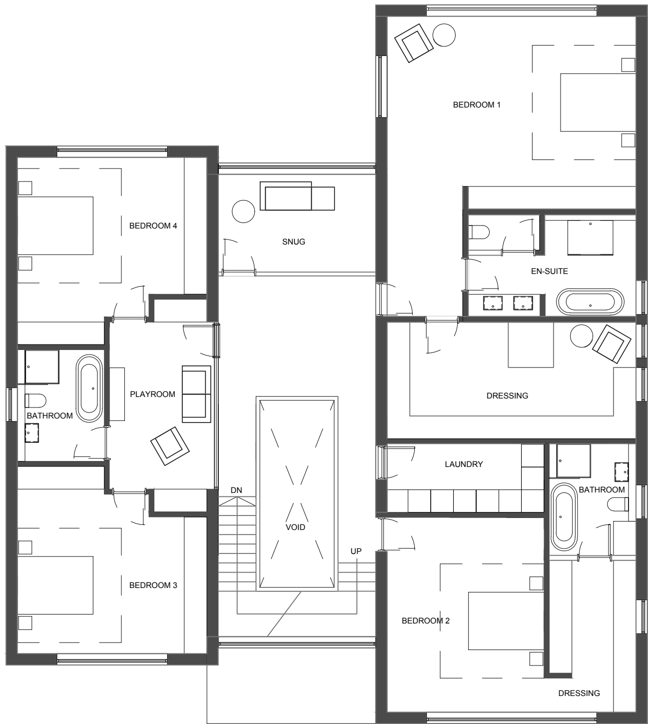
Proposed First Floor Plan 1:100