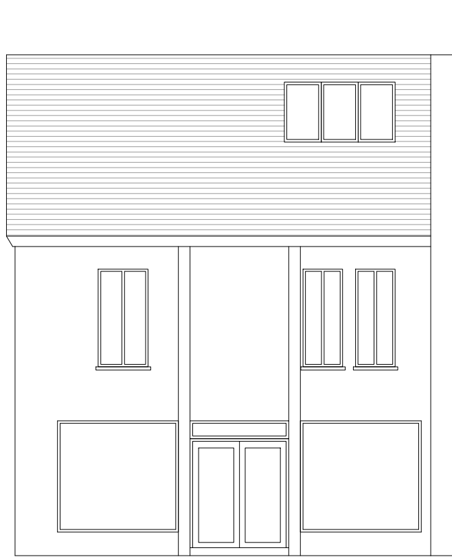
1 Front Elevation 1:100