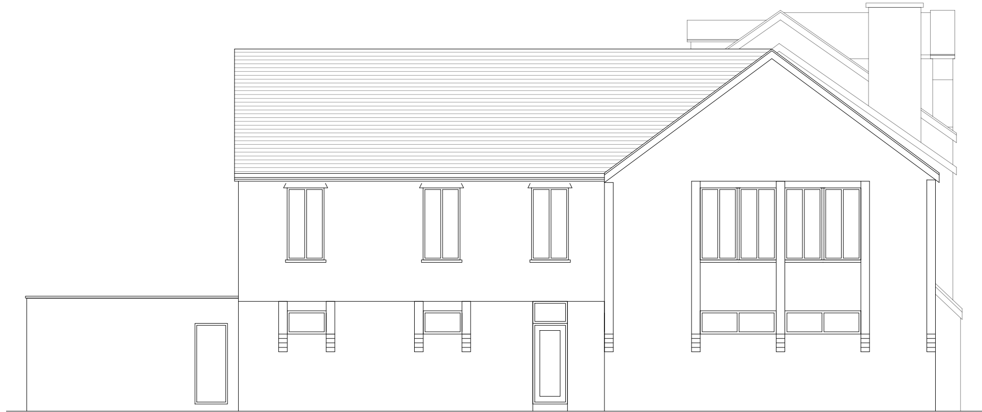
2 Side Elevation 1:100