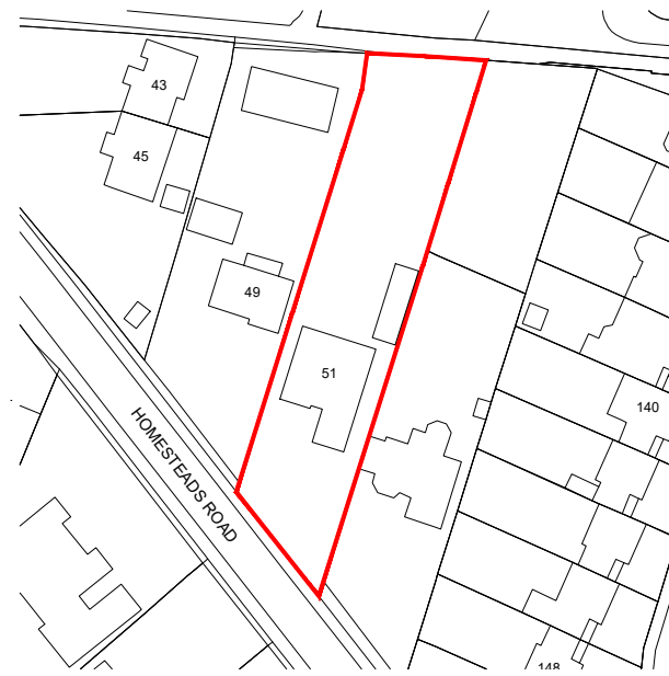
Site Location Plan Ordnance Survey 100053143