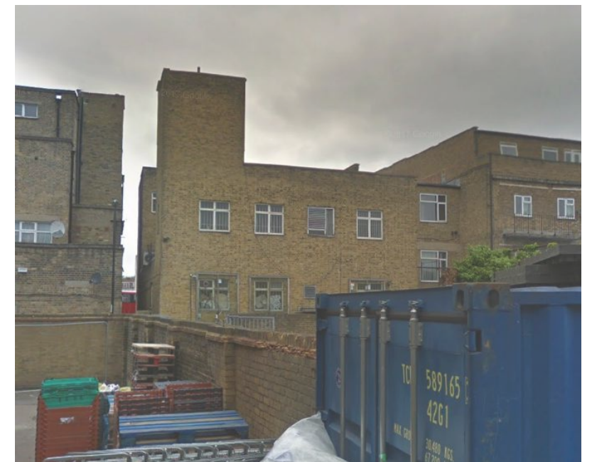
4 Site Photograph - rear elevation NTS @ A3