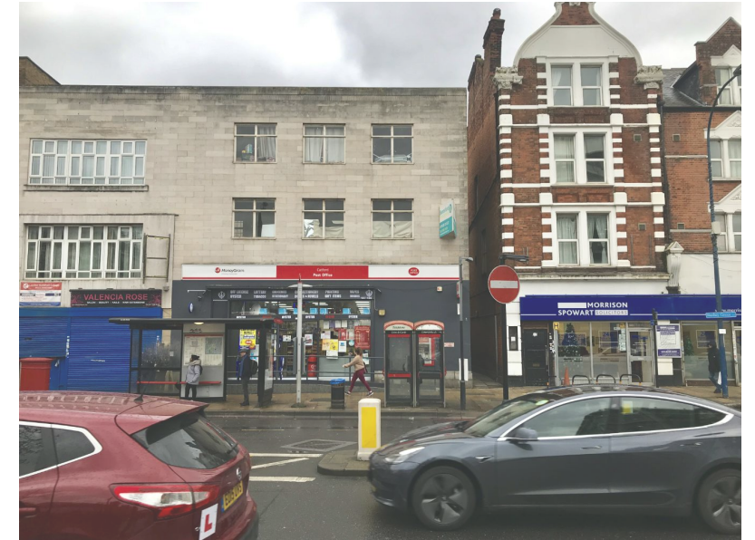
3 Site Photograph - front elevation NTS @ A3