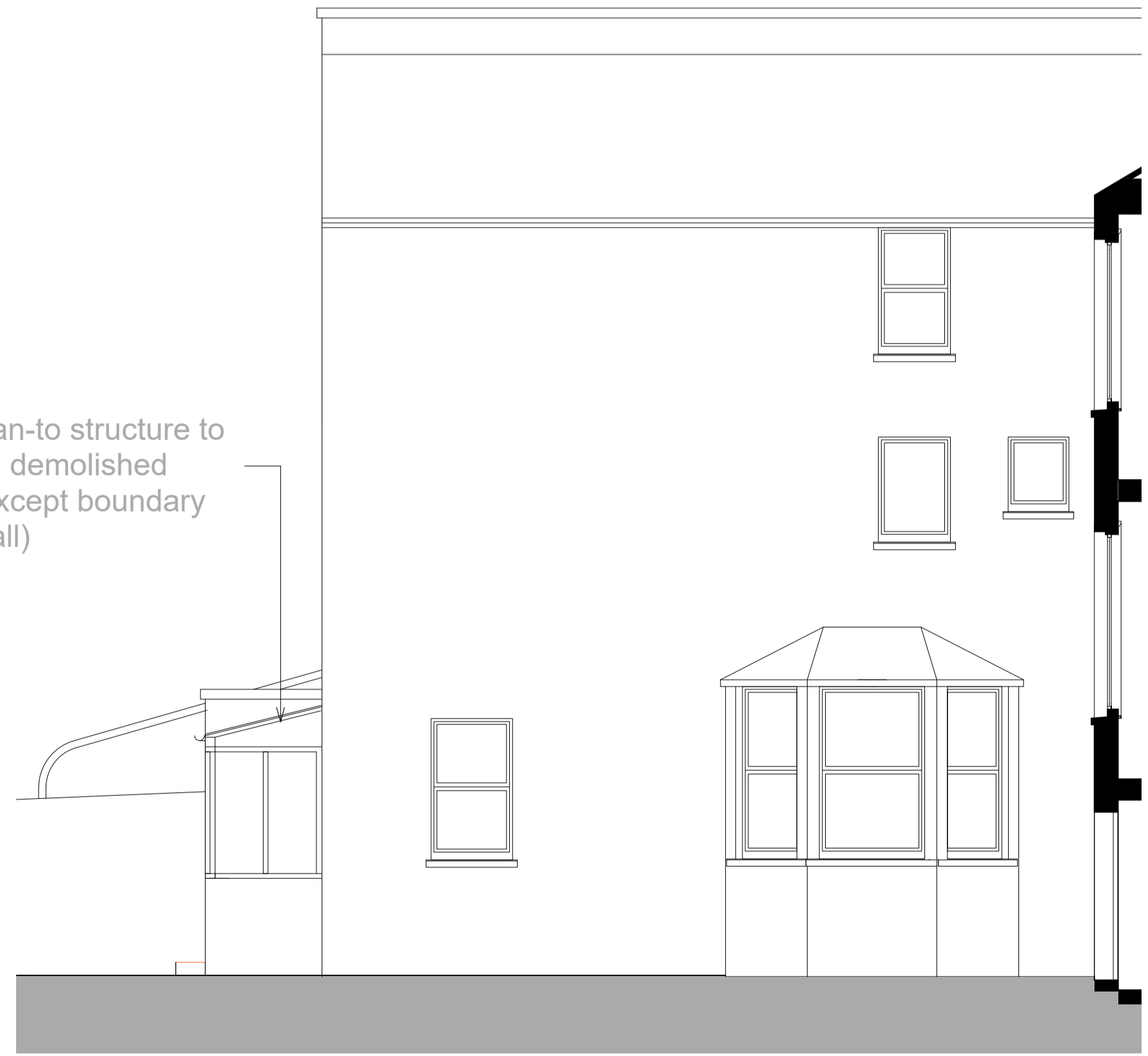
Section JJ 1:50@A1, 1:100@A3

lean-to structure to be demolished (except boundary wall)