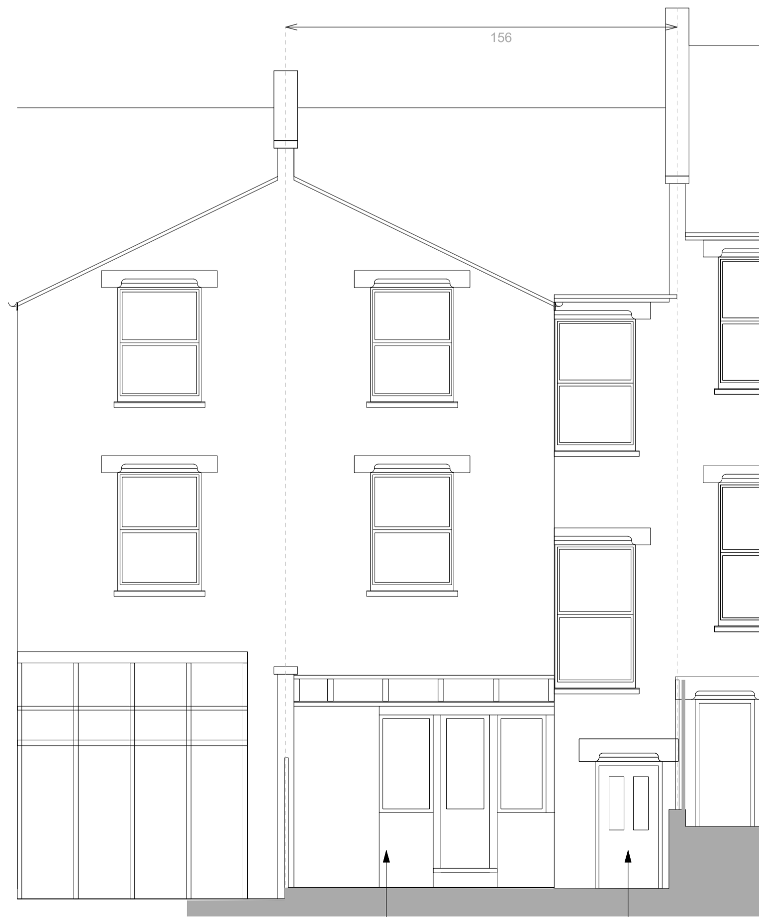
Rear (West) 1:50@A1, 1:100@A3

existing (non original) lean-to structure to be demolished existing door