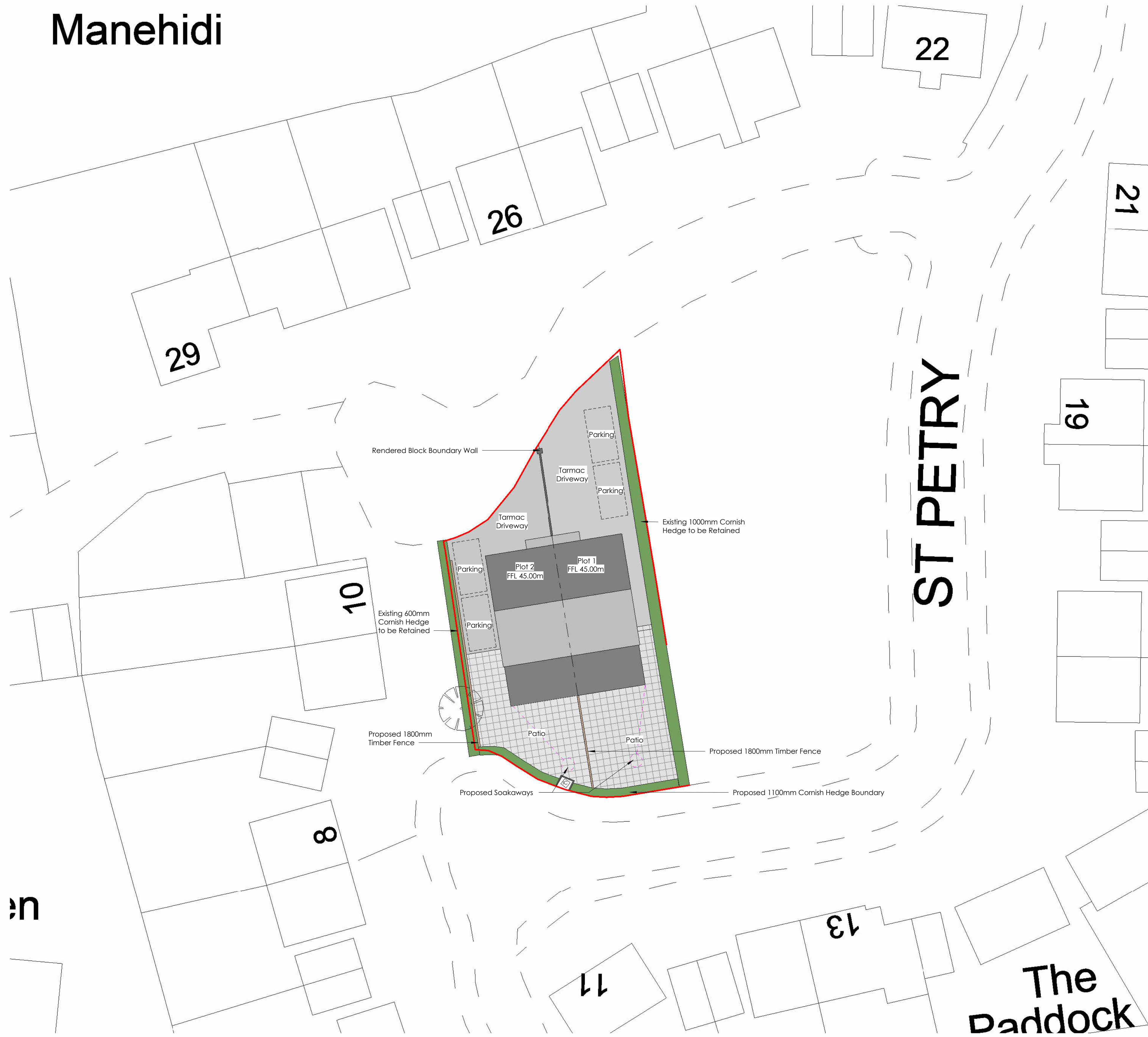
1 Proposed Enlarged Site Plan 1 : 200