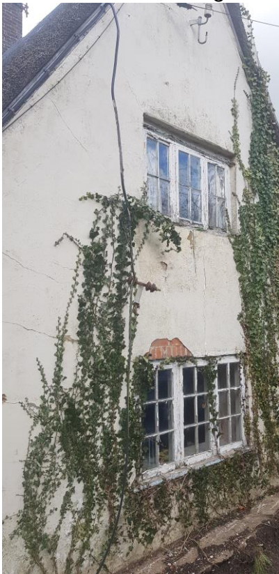
Gable to Road