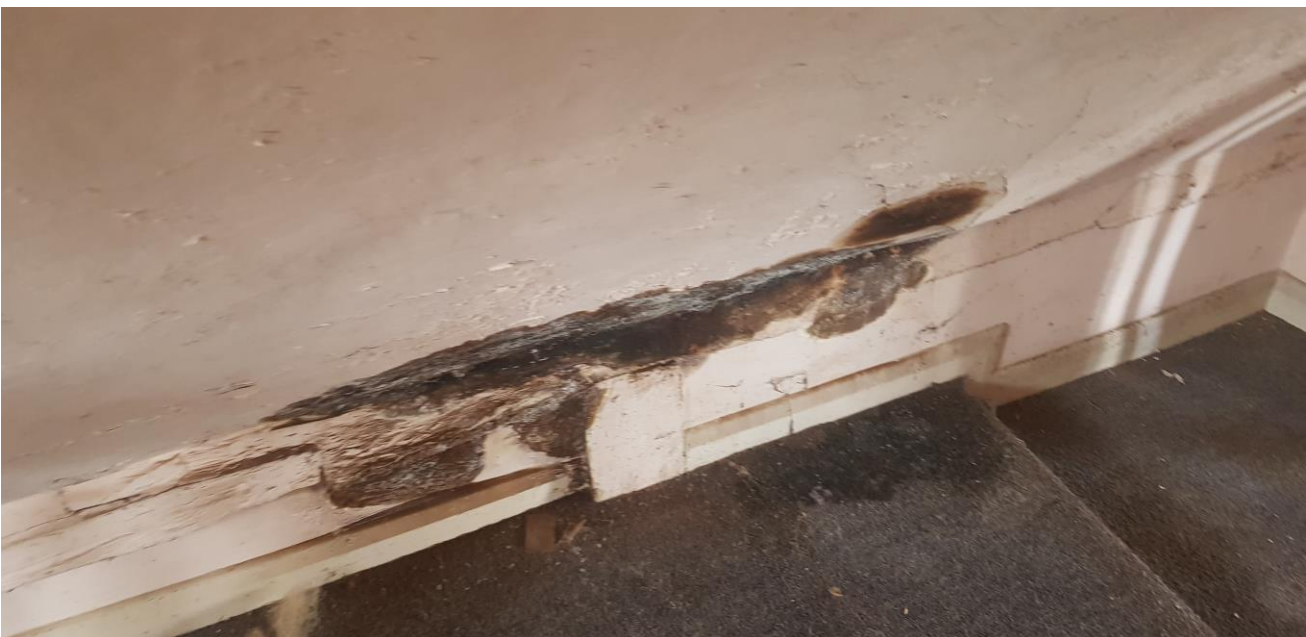
Damp and Fungus Penetration of Timber Frame