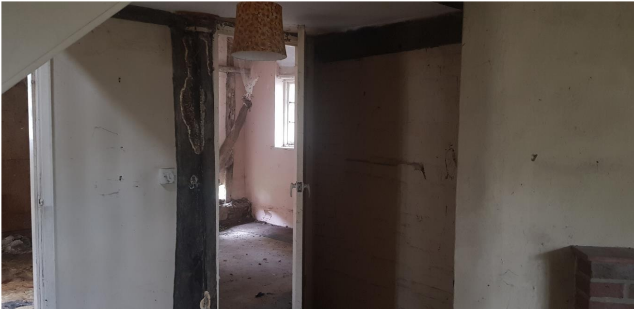
Fungal Growth on Timber Framing