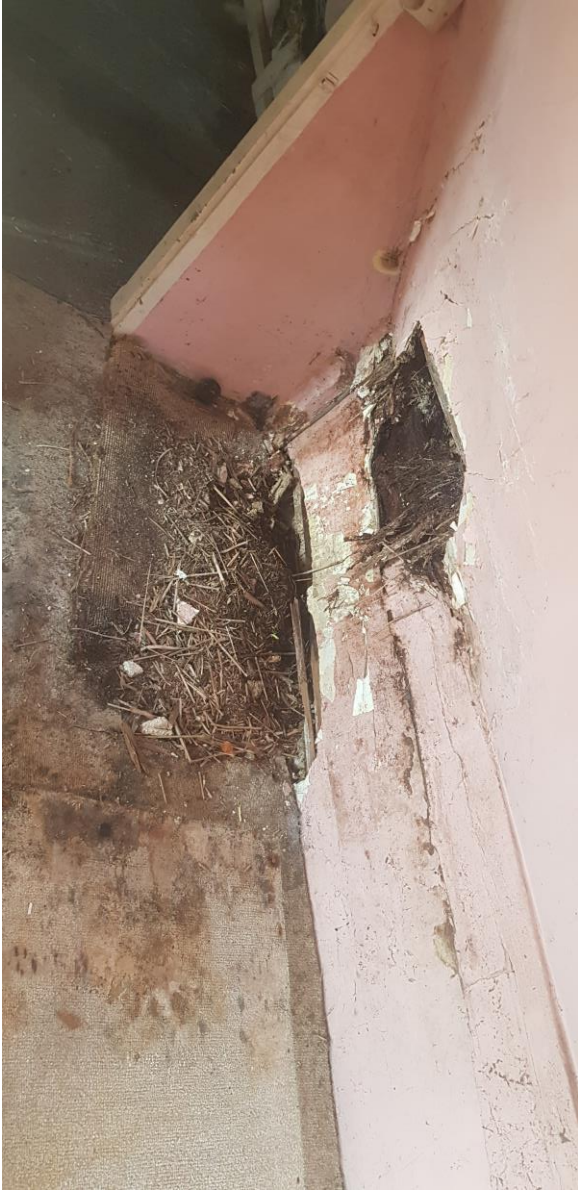
Deterioration of Plaster and Thatch