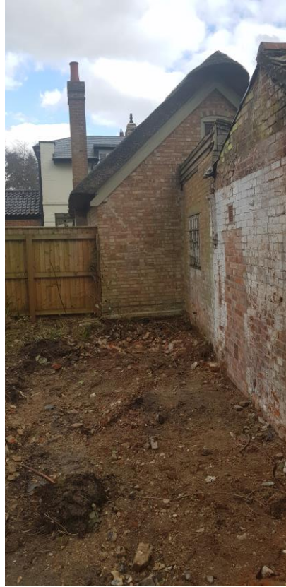
20 th C. Extension