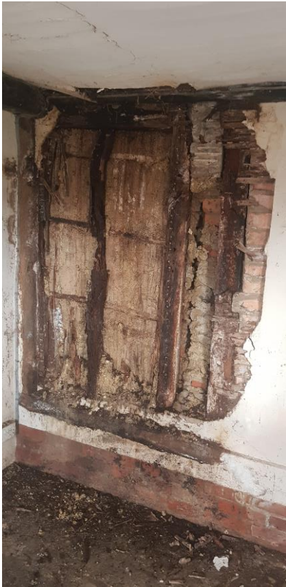
Deterioration of Wall to Living Room Where New Opening Proposed