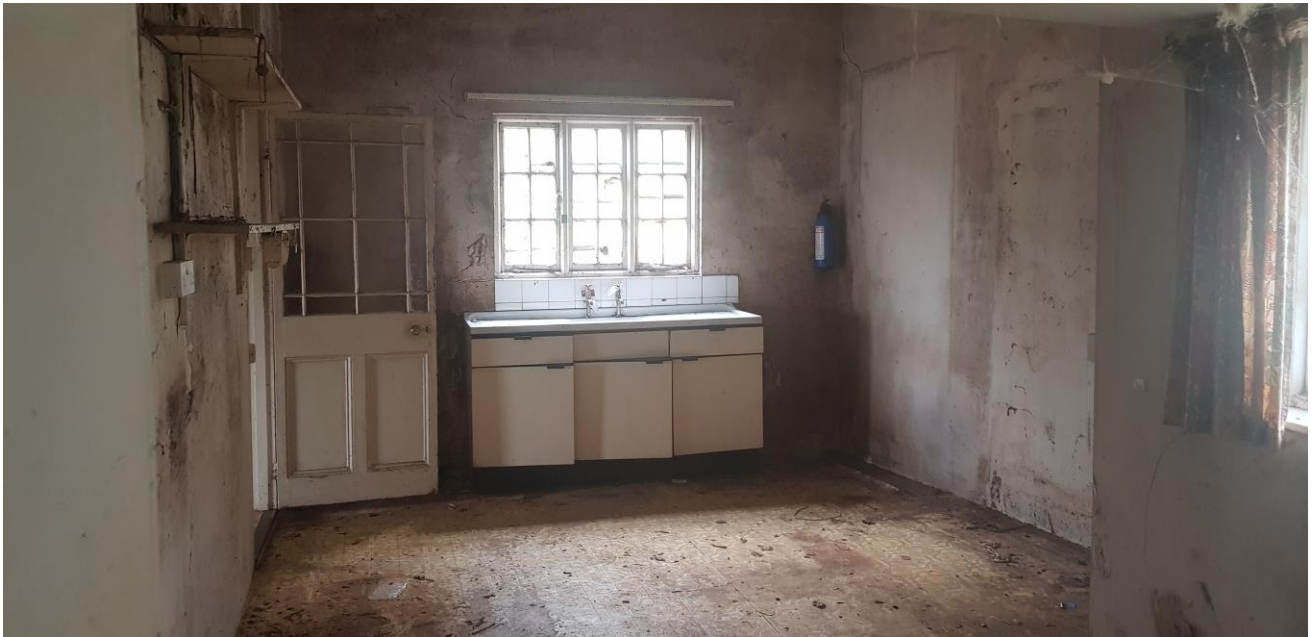
Kitchen Area with Mixture of Plaster Finishes and Damp Ingress