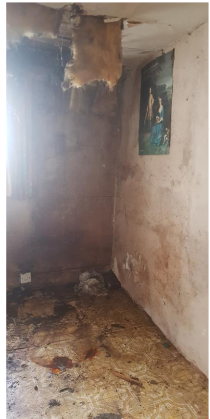
Water Damage to Ceiling Walls and Floors