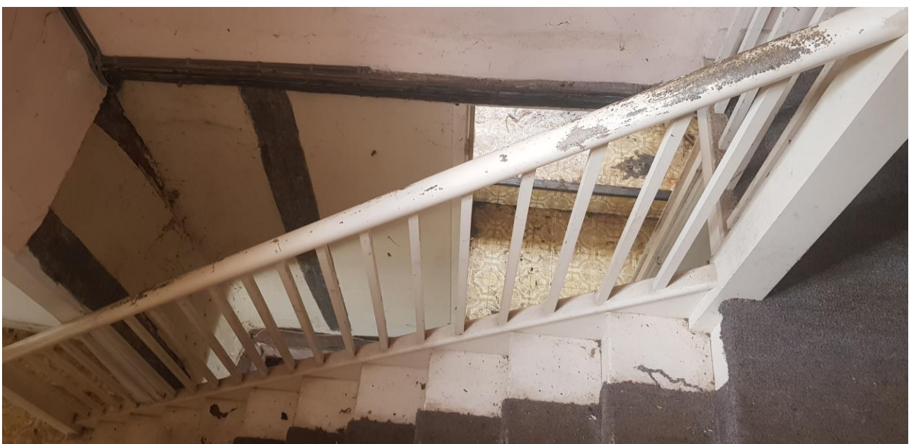
20 th C. Straight Timber Stair and Plasterboard Enclosure