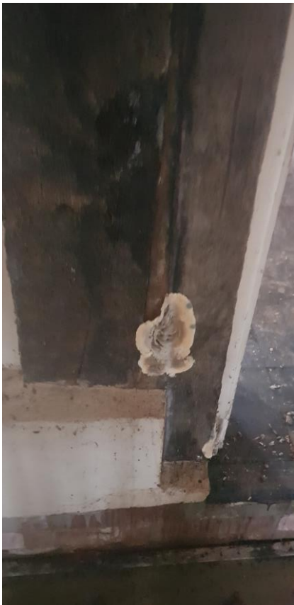
Fungal Growth on Timber Framing