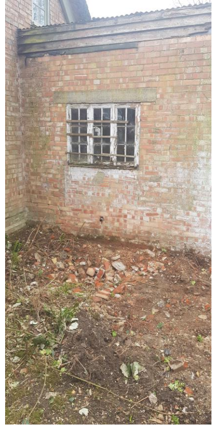
20 th C. Extension