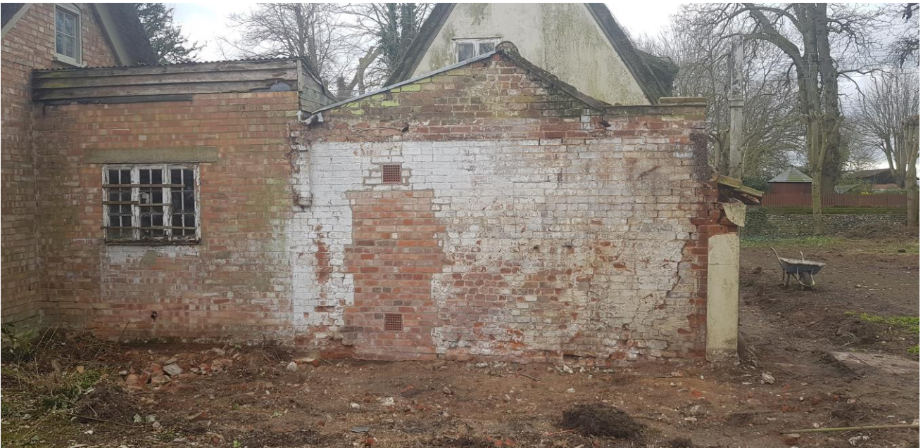
Overall Extent of 20 th C. Extension to Cottage