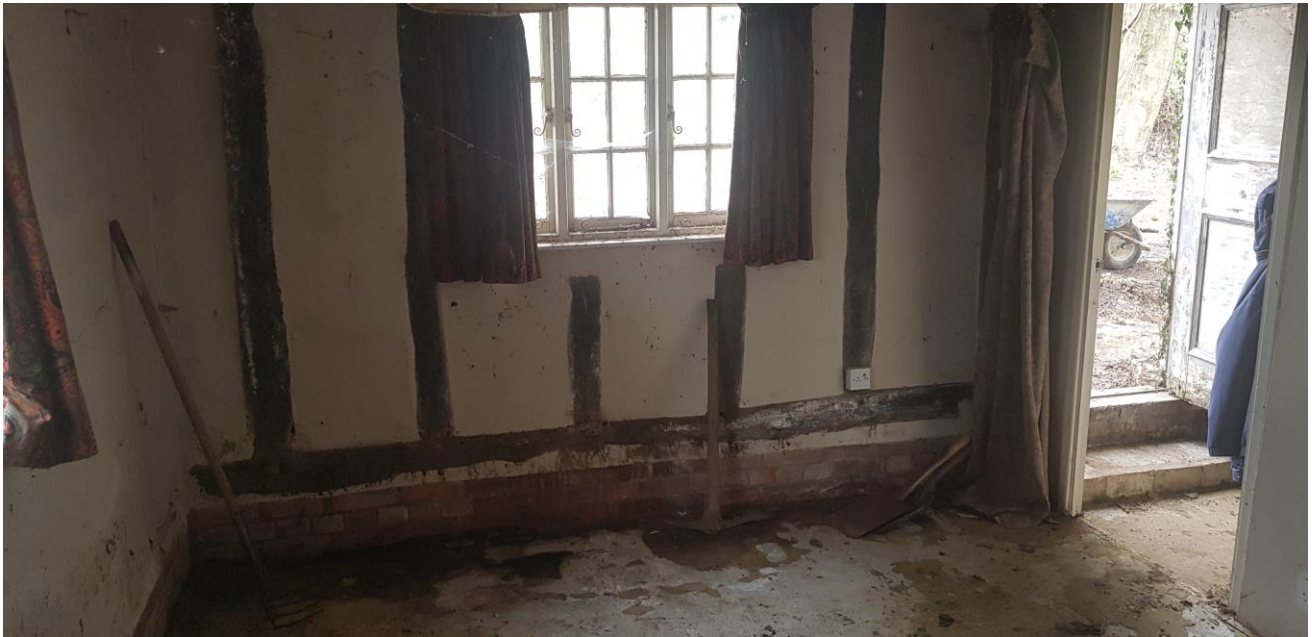
20 th C. Underpinning and Slab to Living Room