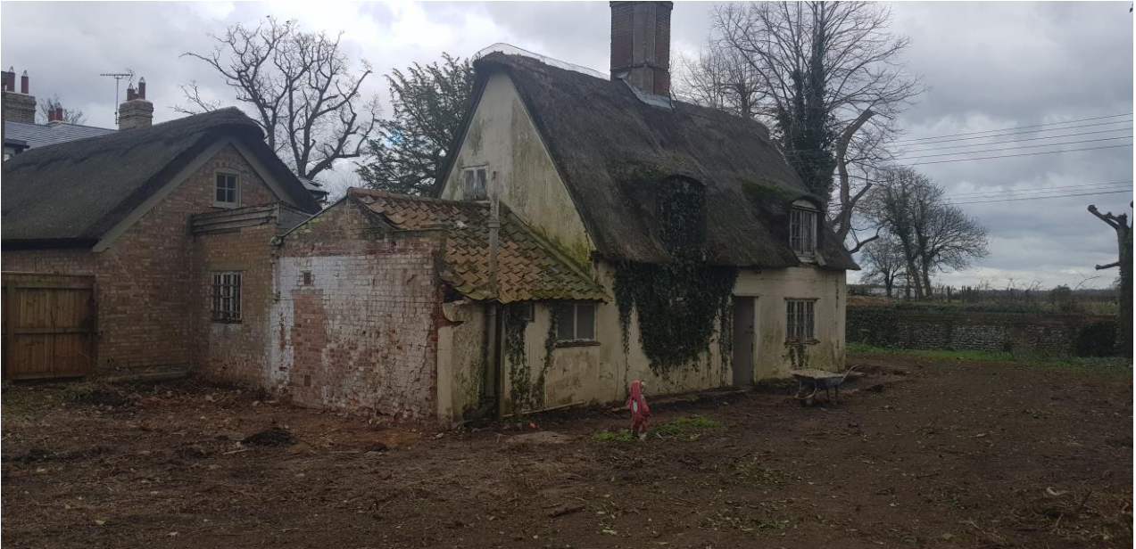
Overall View of Cottage From Garden