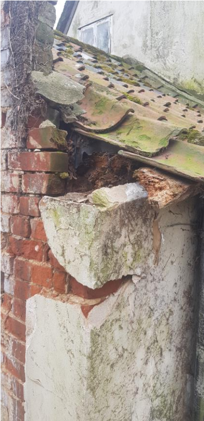
Condition of 20 th C. Extension