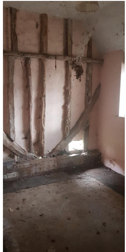
Deterioration of Wall to Rear Entrance Lobby