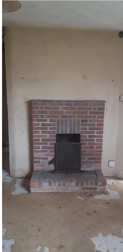
Late 20 th C. Fireplace and Infill Wall in Dining Room to be Removed.