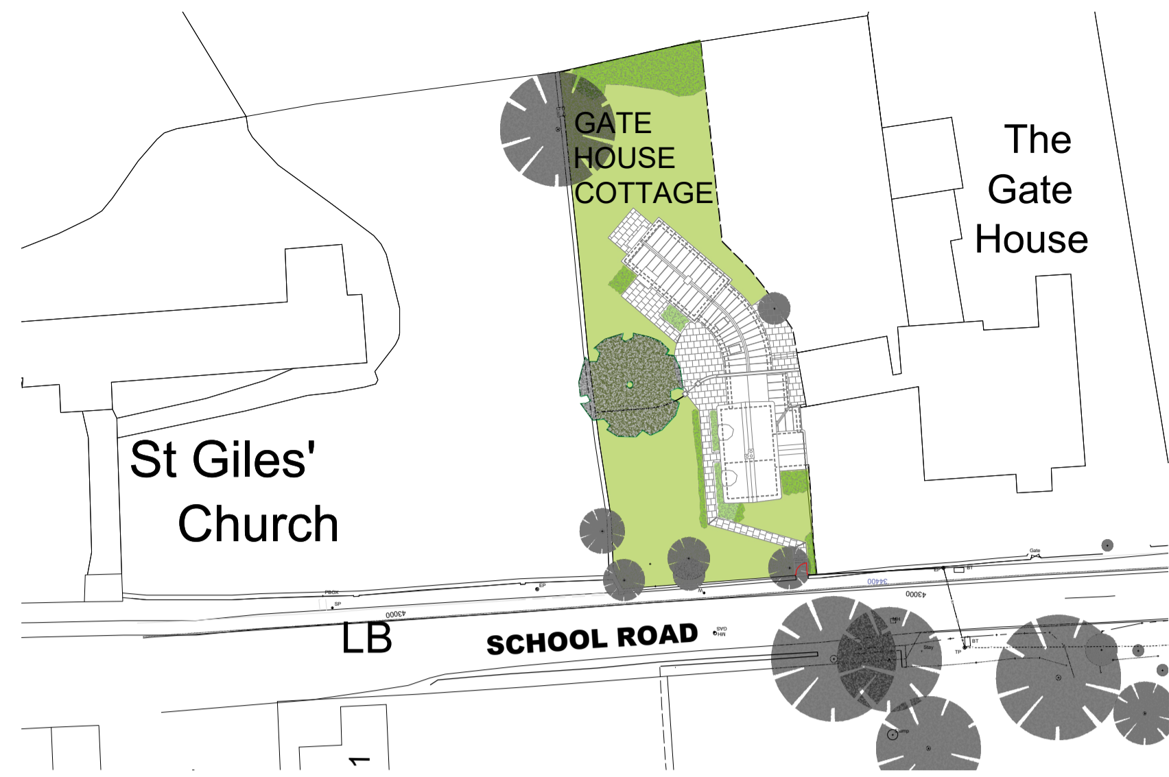
Block Plan - As Proposed 1:500 scale 0m 10m 1:500 Scale Bar