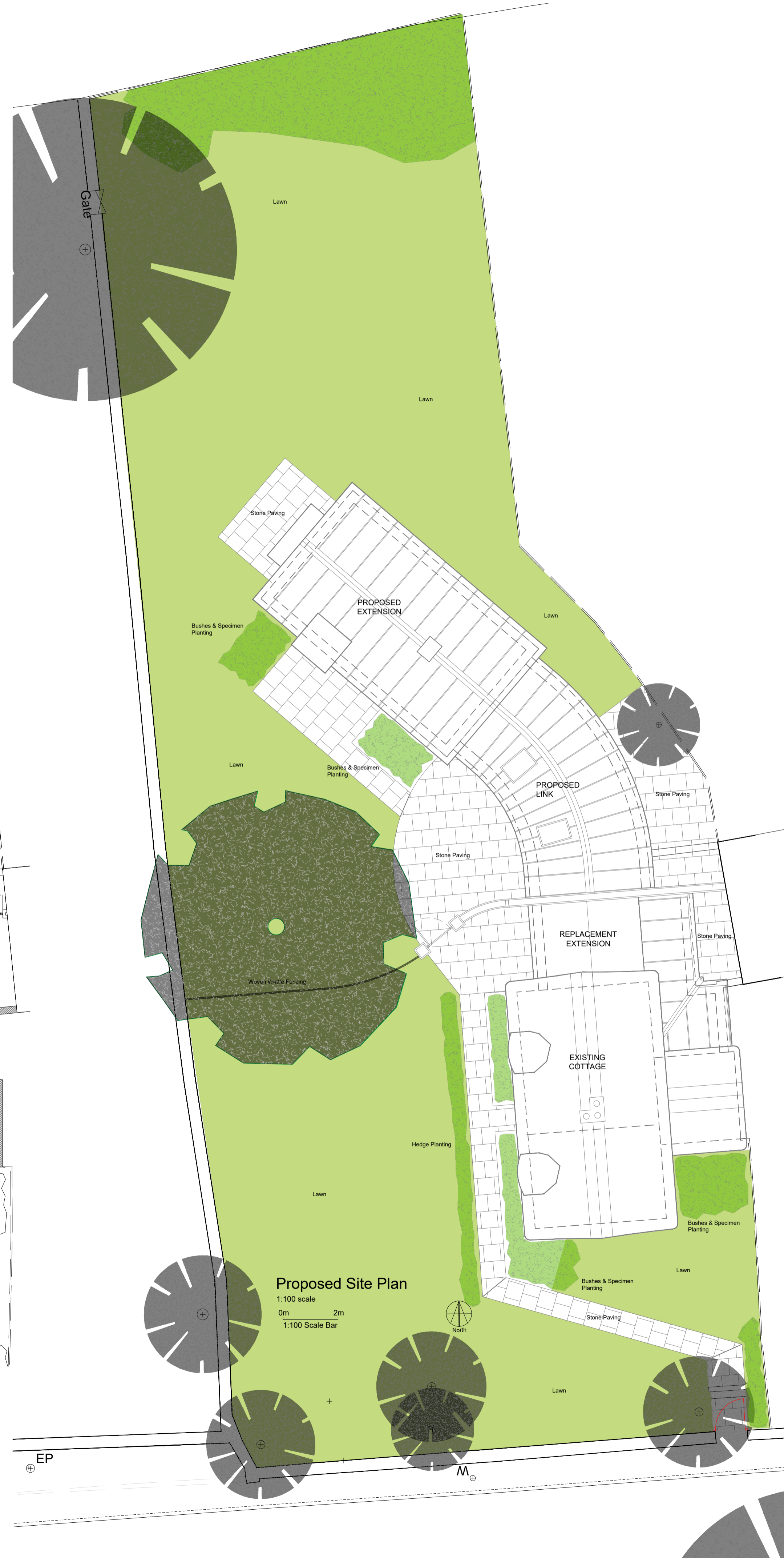
Proposed Site Plan 1:100 scale 0m 2m 1:100 Scale Bar

Only figured dimensions are to be used for construction purposes. This drawing must be read in conjunction with all relevant details for the project. All dimensions are to be checked on site prior to commencement and any discrepancy reported to the Architect or Contract Administrator © Brown & Scarlett Architects 2022 Revisions: Rev. B - 28.11.23 - Window and Door references added to Plans